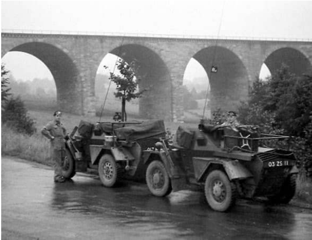
Dingo F206419 03ZS11