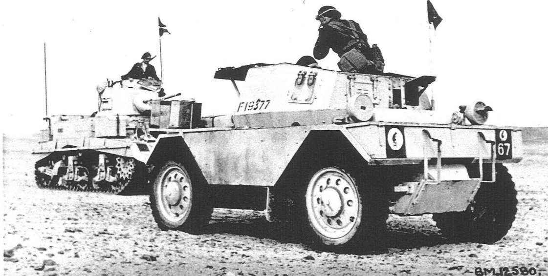
F19377, MkIB, North Africa

This Scout Car was being used by an official army war photographer and reporter to tour the battle fields of the Northern Desert, Interestingly it was probably this vehicle with a few others that was observed by the 11 th Hussars to be 'stooging' around the desert where it should not have been. It was suspected to be a captured vehicle and there was much discussion as to if the vehicle should be fired upon before its true identity was established.