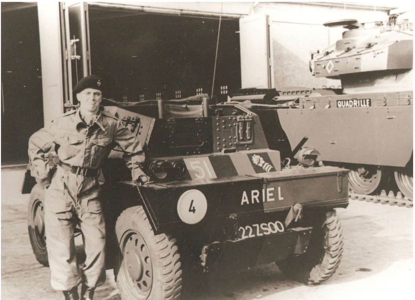
Daimler Scout Car F329562 222S00 of the 6th Armoured Division, and unidentified Senior Armoured Regiment Circa 1951