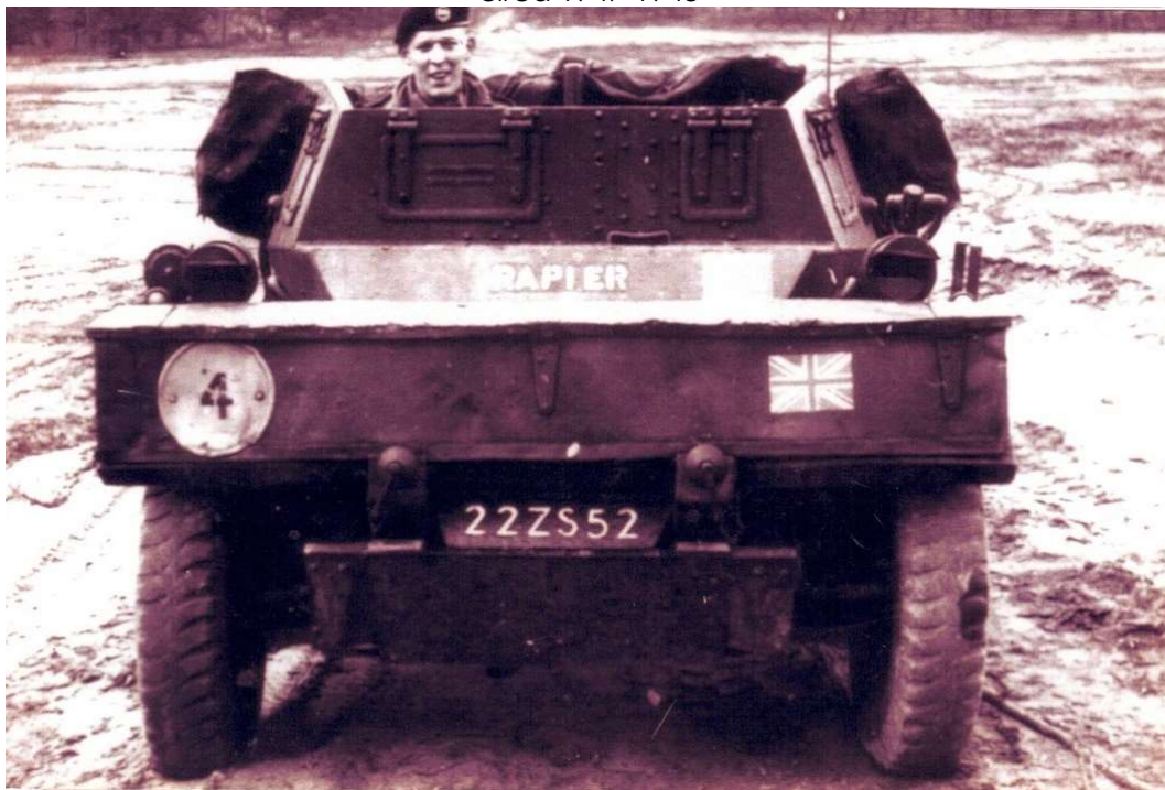
Description: 2 nd RTR Germany dingo F329703 22ZS52 RAPIER circa 1947-1948