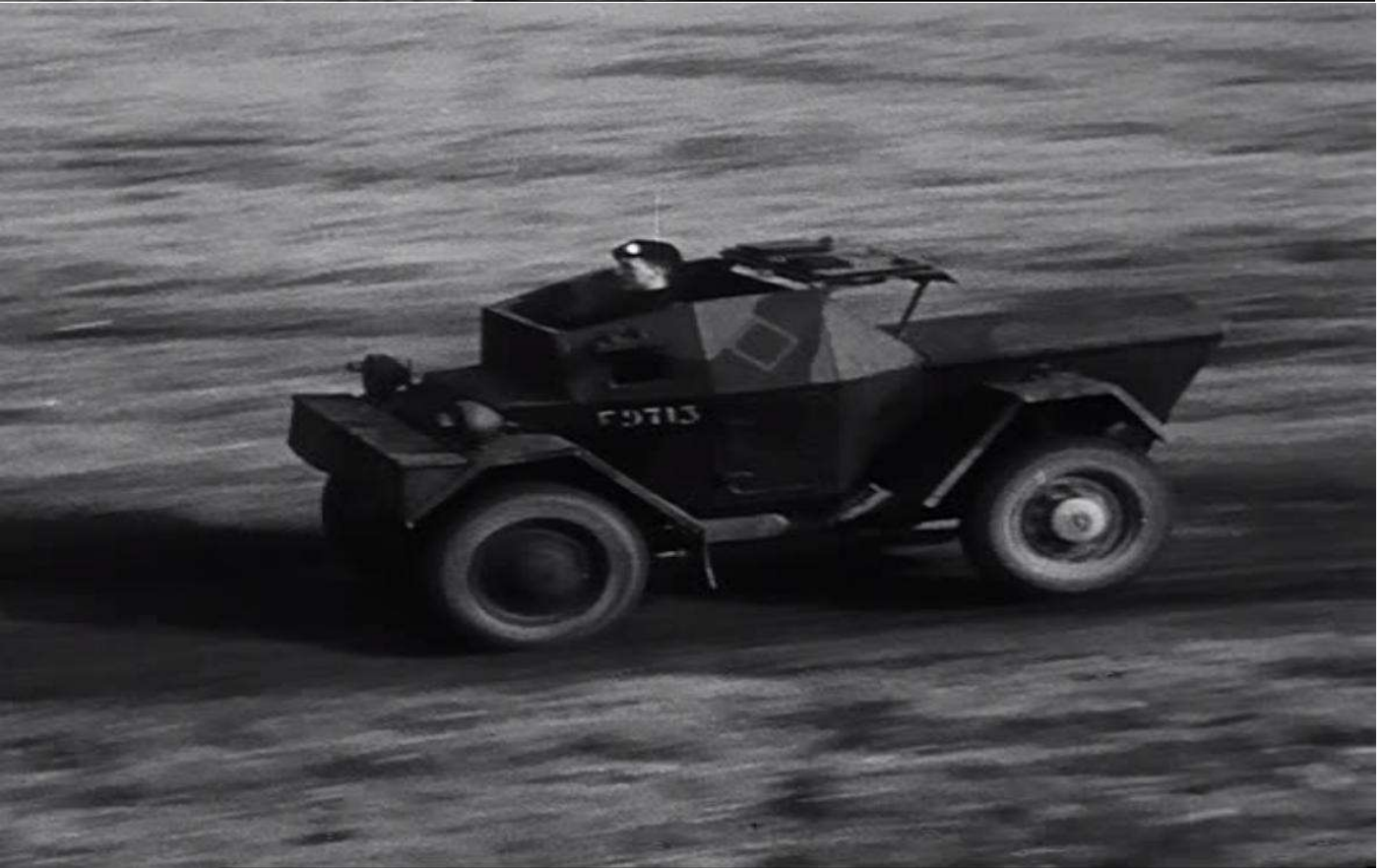
Film Tank Battle 1942