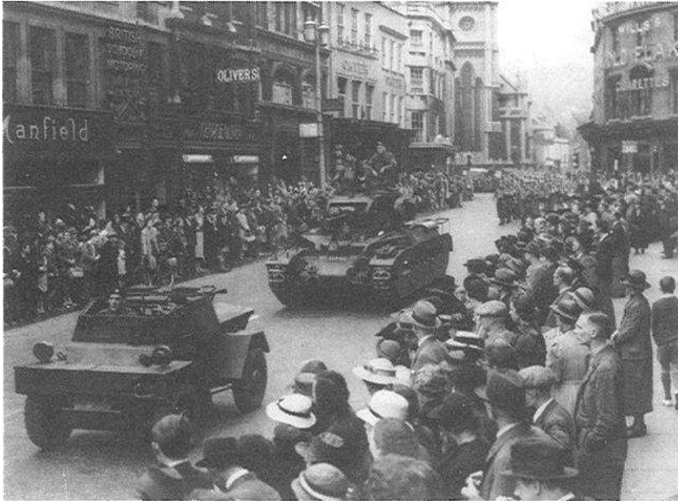
A 'Speed The Tanks' parade in Bath, September 1941, with a Dingo and a Matilda MkII leading a detachment of the local Home Guard.