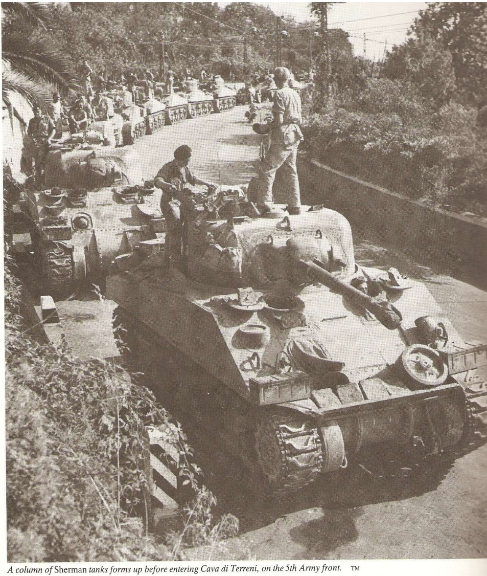
A column of Sherman tanks forms up before entering Cava di Terreni, on the 5th Army front. ™