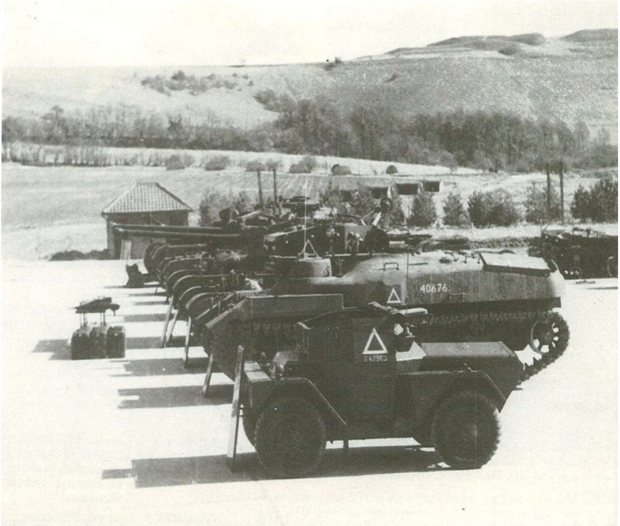
3RTR in the UK.

Image courtesy of Royal tank Regiment-A pictorial History by George Forty.