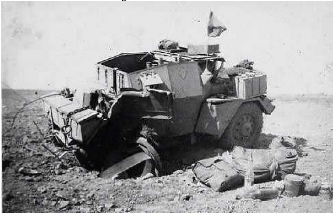
F47700 ran over an anti tank mine on 26th October 42 whilst commanded by Major Greaves