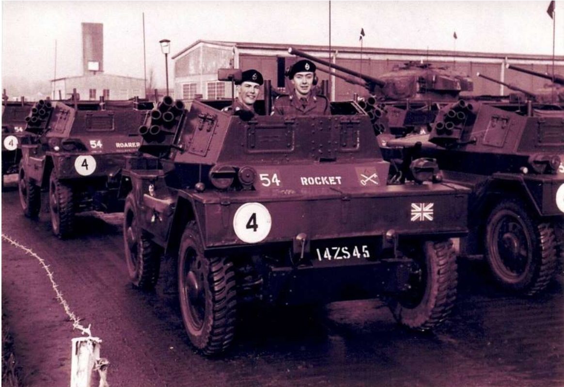
Description: 2 nd RTR Germany dingo 14ZS45 ROCKET circa 1947-1948