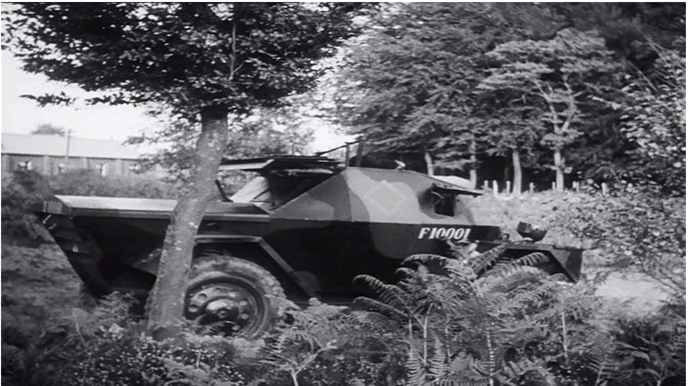
Tank Battle 1942