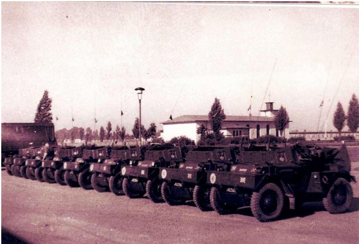
Description: 2 nd RTR Germany circa 1947-1948