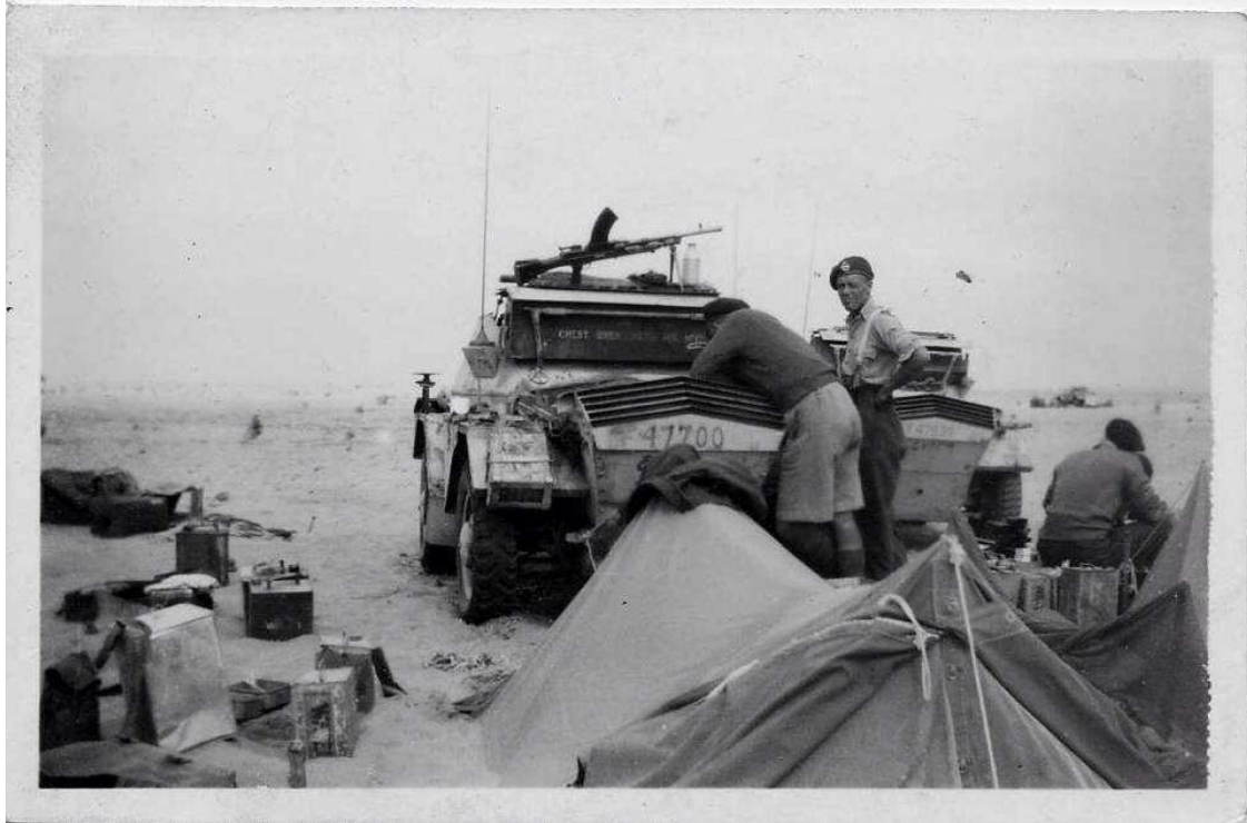
dingo.F47700 in North Africa

41RTR, and served from 1939, first in North Africa