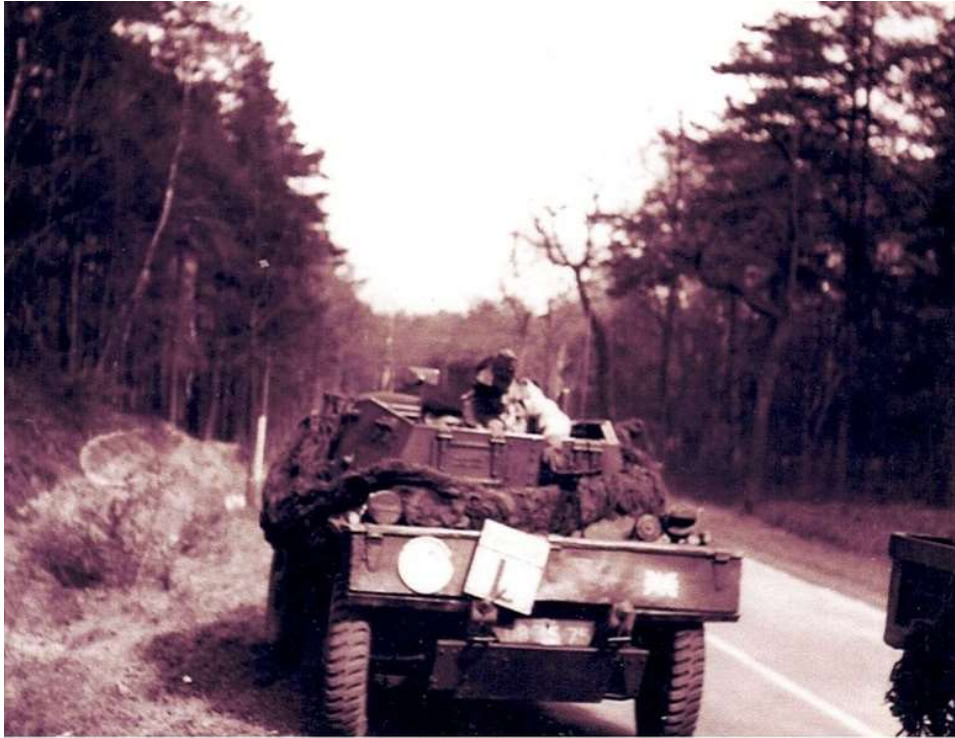
Description: 2 nd RTR Germany dingo F207267 08ZS75 circa 1947-1948