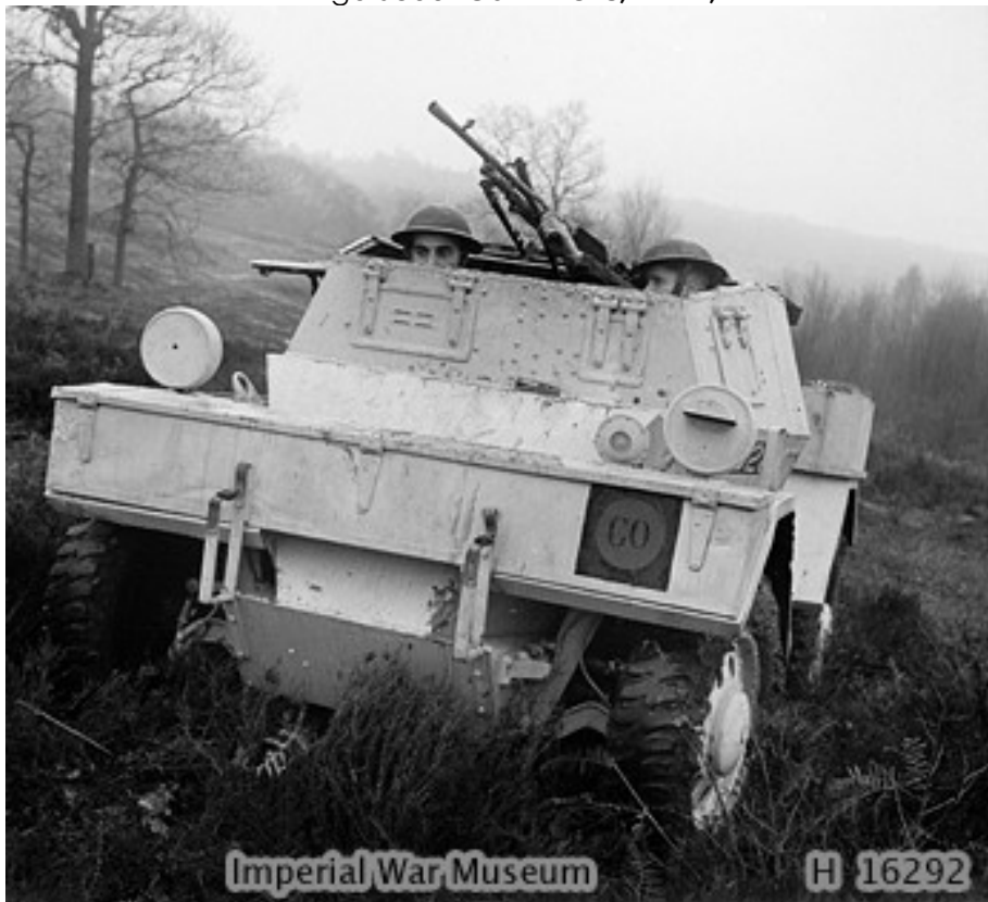
Reference H1 6292