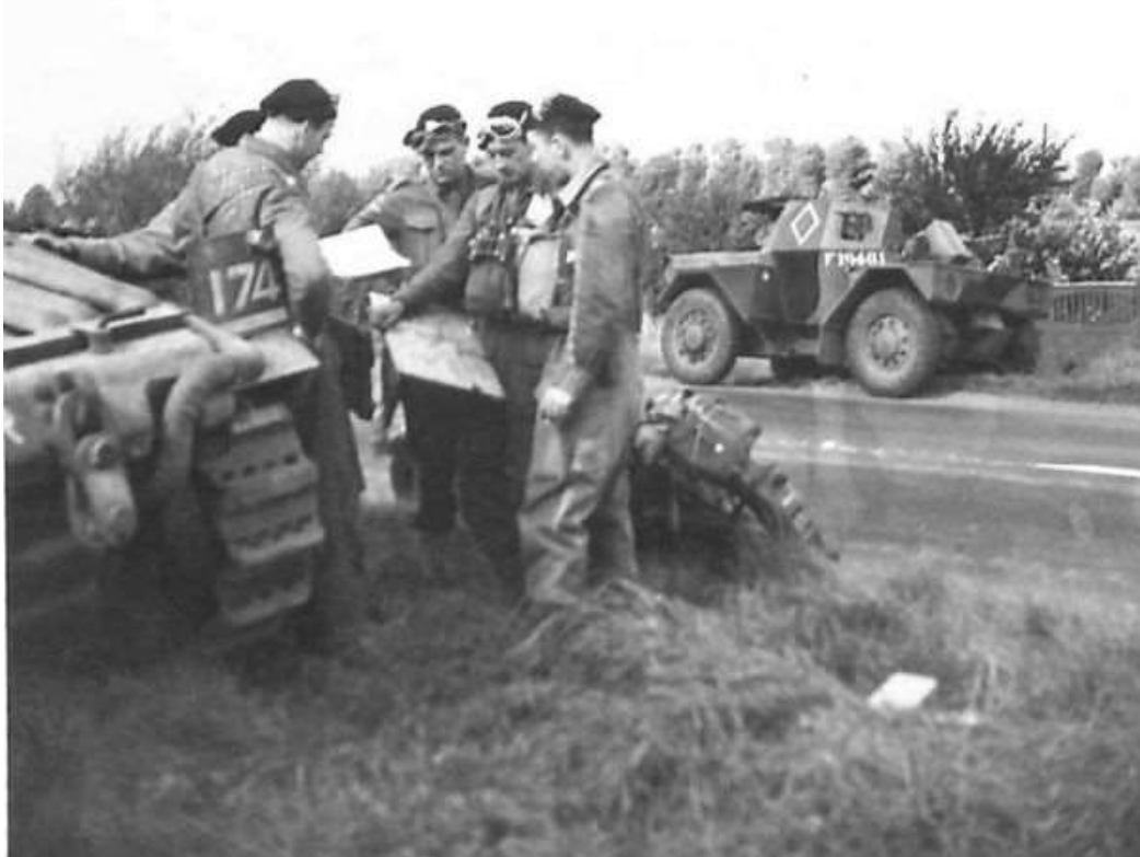
Dingo F19461 IWM H 14385 the dingo MkIB returns to base with recce info during a training exercise. Date0 1-10-1941

It returned to the United Kingdom in March 1942 at Wemyss Bay, Clyde and moved to Haddam Castle by 17 March 1942. It then moved to Auchterarder and was disbanded in August 1942