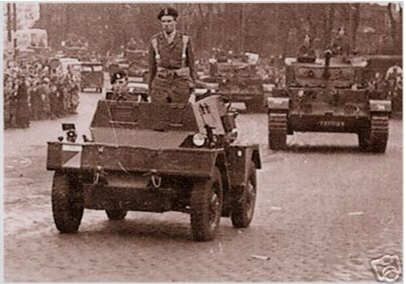
Victory parade in Harrogate in Yorkshire.1945.