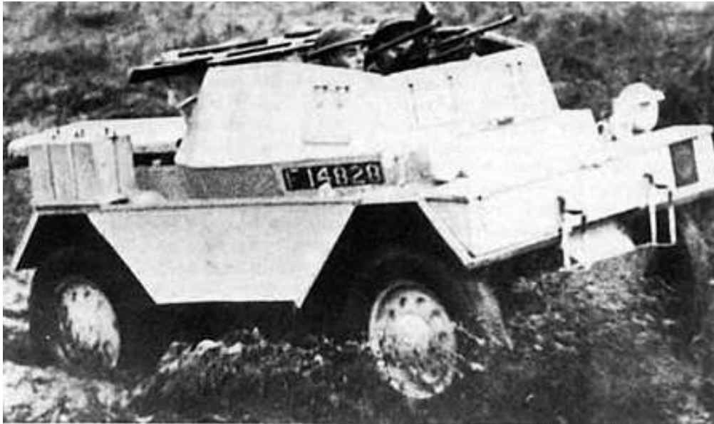
Dingo Scout Car F14828, MkIA