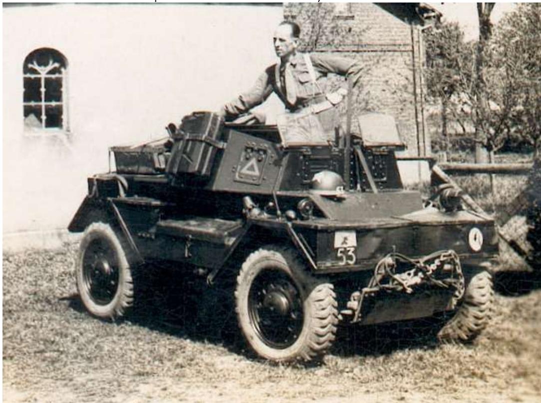
Description: Lt L Jones 5th RTR, 22 AB 7AD in Germany circa 1945

This Scout Car was being used by an official army war photographer and reporter to tour the battle fields of the Northern Desert, Interestingly it was probably this vehicle with a few others that was observed by the 11 th Hussars to be 'stooging' around the desert where it should not have been. It was suspected to be a captured vehicle and there was much discussion as to if the vehicle should be fired upon before its true identity was established.