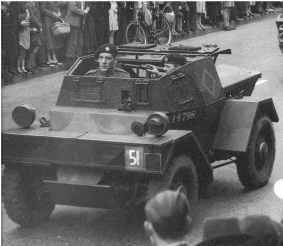
This liaison vehicle belongs to the Senior Armoured Regiment, possibly of VII Corps