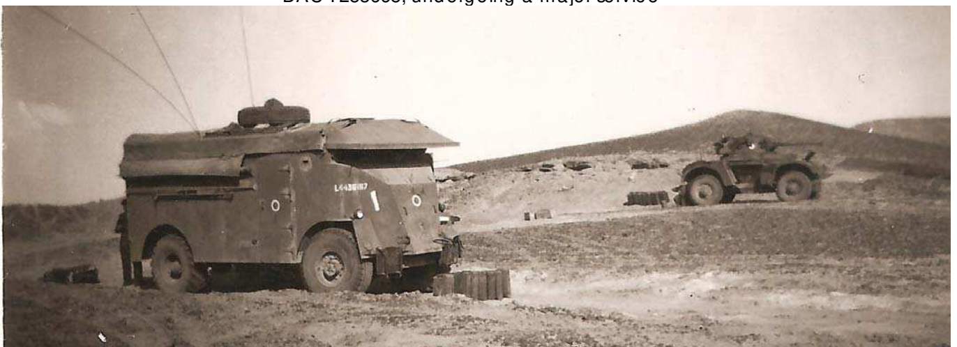
The Guy armoured command vehicle. That among other important things contained the commanding officers hammock! Description: An armoured car of 1 st Troop, C Squadron, 16-5 th Lancers. Circa 1946 -47