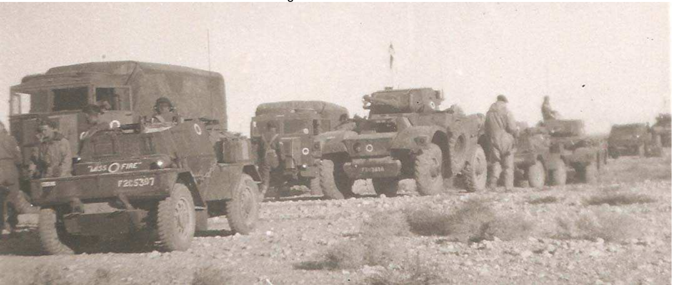
DSC F205397 named 'Miss-Fire'