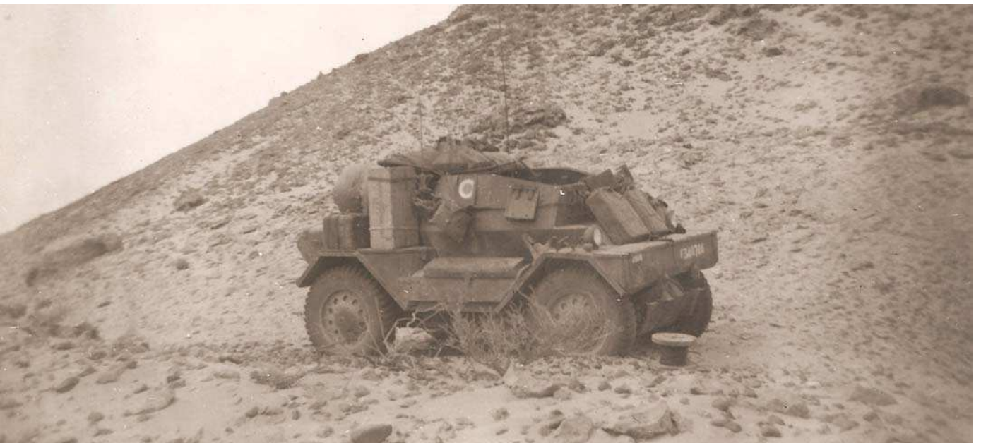
DSC F340786 named 'Maidens Prayer'