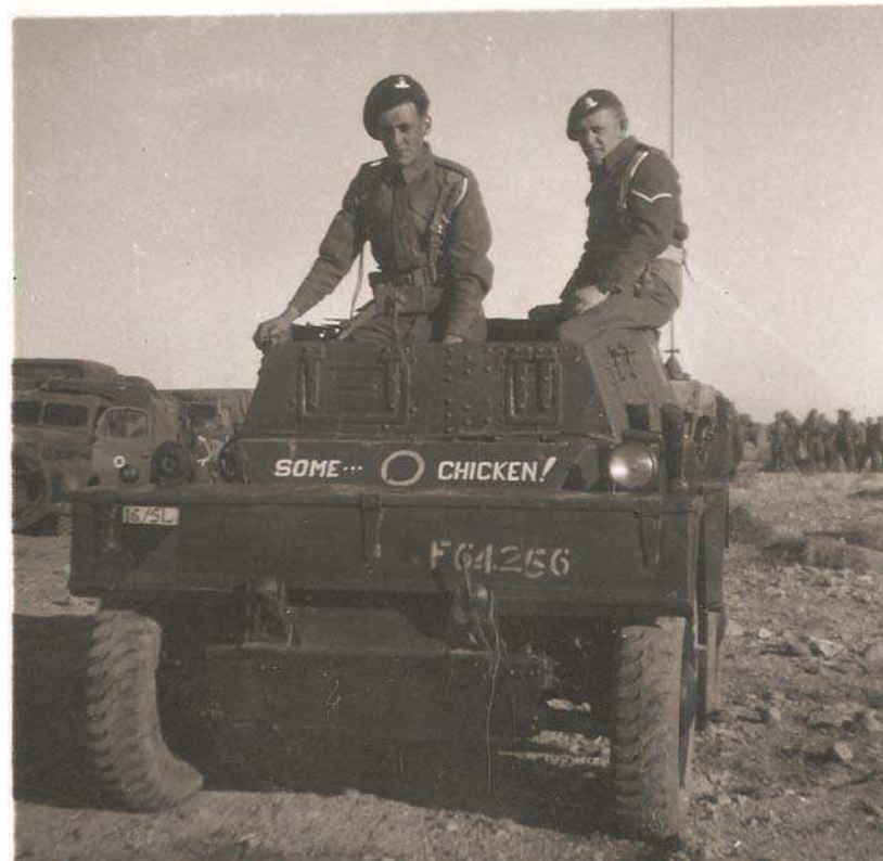
DSC F64256 named 'Some – Chicken' This was Trooper Ainsworth's Dingo