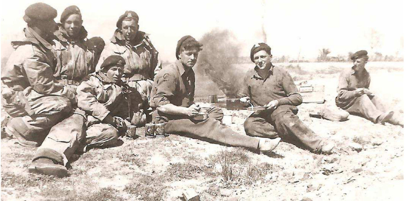
Dispensing with the use of their No2 cook sets, the crew here use the famous Bengazi cooker