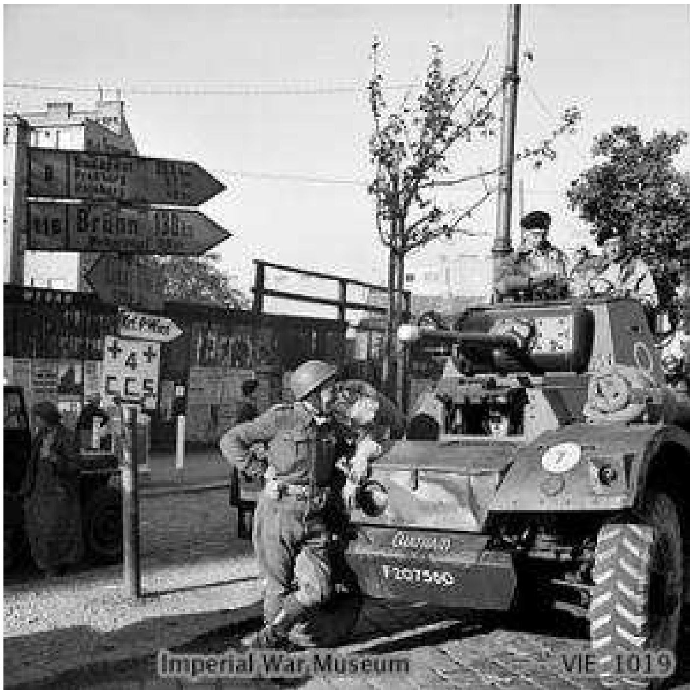
Image courtesy of the Imperial War Museum Reference VIE 1019 PHOTOGRAPHER: Lambert RP (Sergeant):No 2 Army Film & Photographic Unit

Description: An armoured car F207560 of the 12th Royal Lancers arrives in Vienna where the regiment took over garrison duties from the 2nd Battalion, Lancashire Fusiliers. The regiment was stationed at Meidling Barracks.