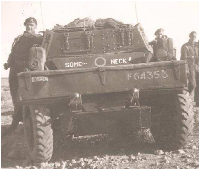
DSC F64353 Some Neck