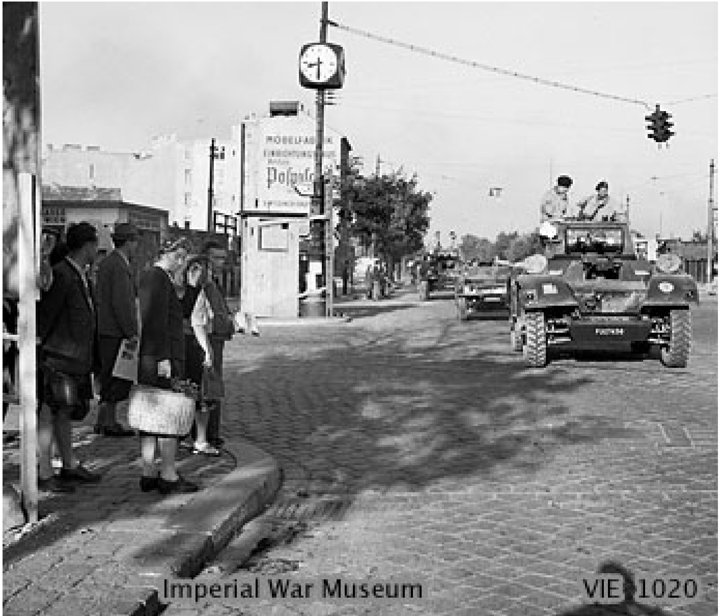
Photo sourced from Imperial War Museum VIE 1020 Photographer: Lambert RP (Sergeant) of No 2 Army Film & Photographic Unit

Description: Armoured cars (F207434) and scout cars of the 12th Royal Lancers move through Vienna towards Meidling Barracks where the regiment took over garrison duties from the 2nd Battalion, Lancashire Fusiliers.