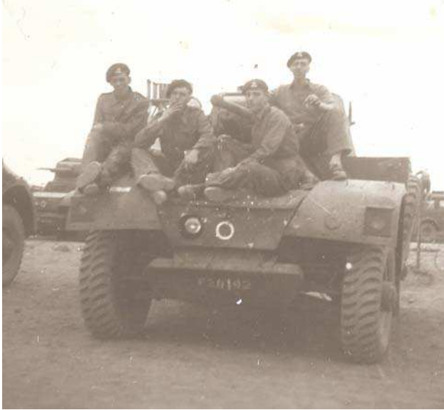
Seuz

Although the war was over and the Empire dramatically reduced in size, the 16th/5th Lancers continued its tradition of service abroad. In 1948, almost immediately after its return from Germany, the Regiment served overseas for five years in Egypt (Cyrenaica and Tripolitania). This deployment was at a particularly sensitive time as the nationalist party in Egypt was gaining influence. This came to a head in 1952 with the overthrow of King Farouk by the republican nationalist Colonel Nasser, marking the beginning of the end of British influence in the Near East.