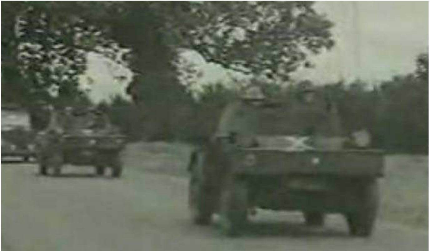
17-21 Lancers Patrol circa 1940