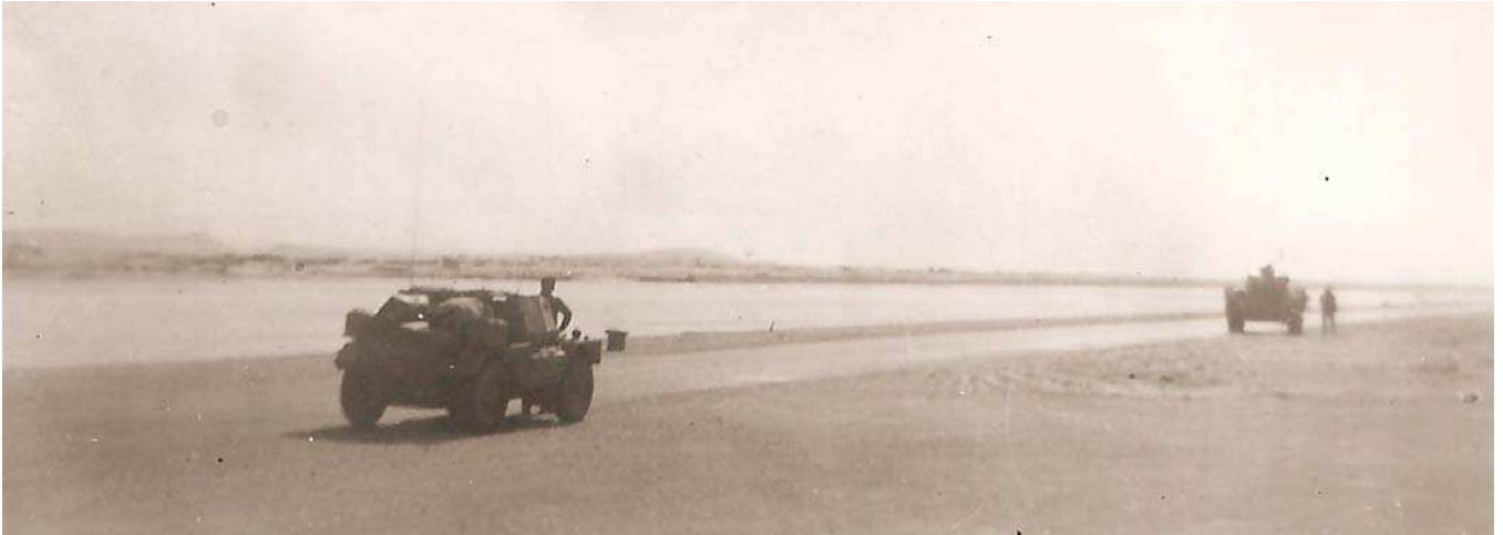
On patrol along the Canal