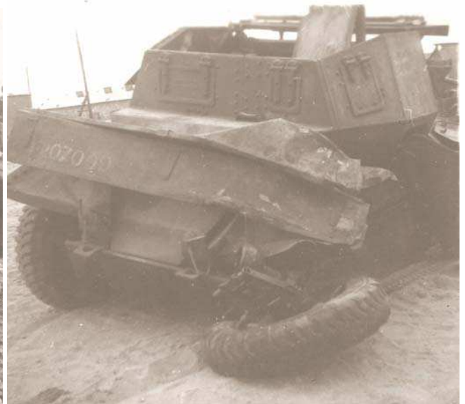
DSC F207009 loosing a contest with a tank transporter