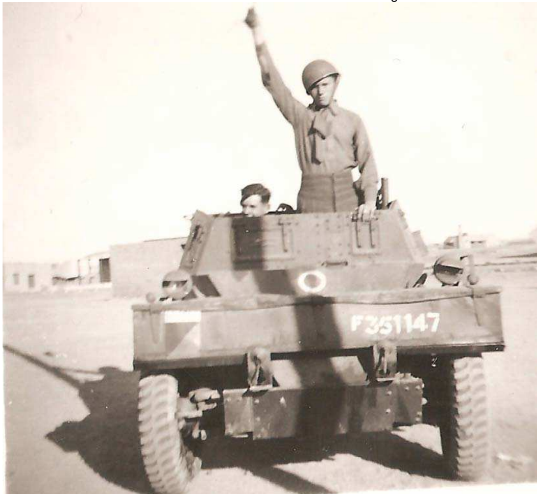
DSC F351147, 25th December 1946, everyone is drunk!

Description: An armoured cars of 1 st Troop, C Squadron, 16-5 th Lancers. Circa 1946 -47