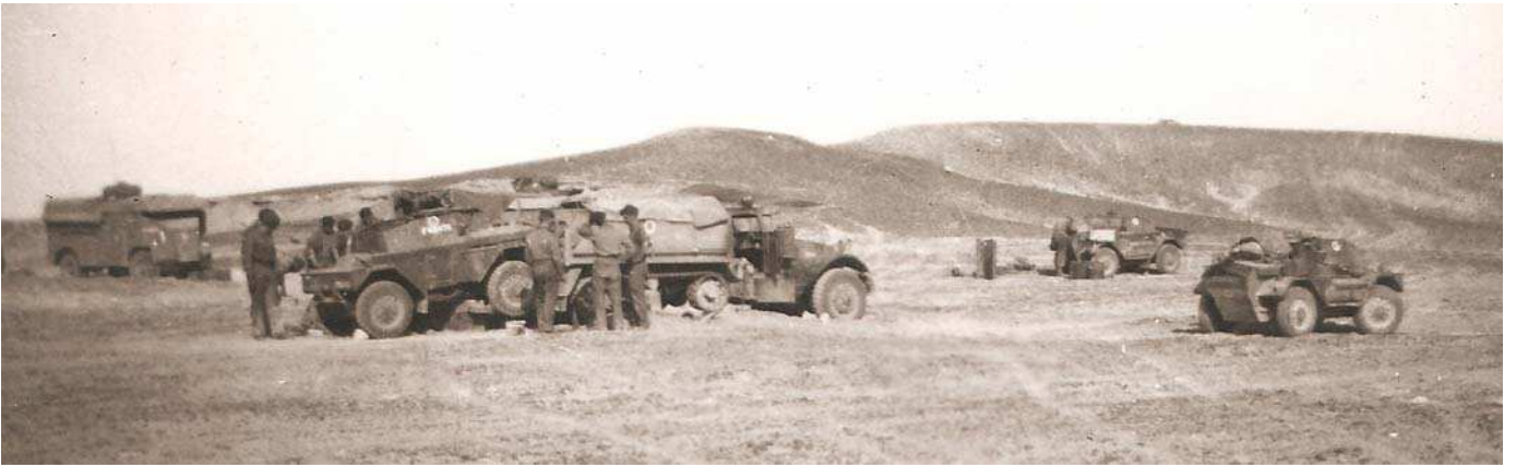
DSC F48476 being recovered after a breakdown