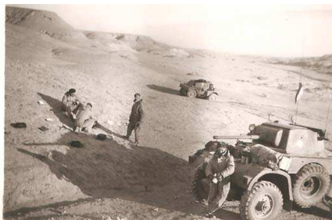
Description: An armoured cars of 1 st Troop, C Squadron, 16-5 th Lancers. Circa 1946 -47