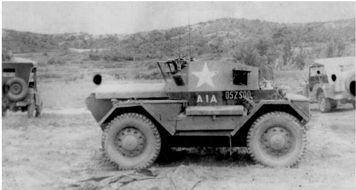
Dingo of 11 Troop 7th Royal Signals at Imjim, Korea 1951.