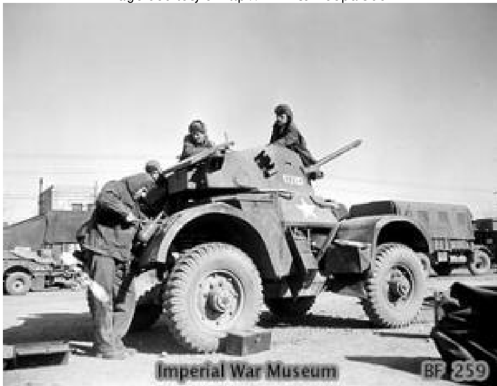
Photo Reference BF 259

Image courtesy of http://www.servicepals.com