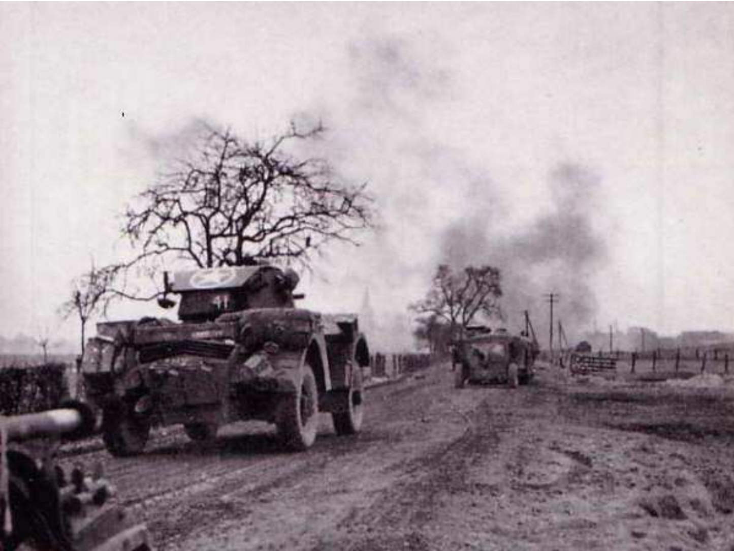
(Photo sourced from the internet & Simon Hamon) Photographer: Unknownt

Description: Believed to be a Daimler armoured car of 2nd Derbyshire Yeomanry, due to the similarity to the stowage and marking of the vehicles previously shown.