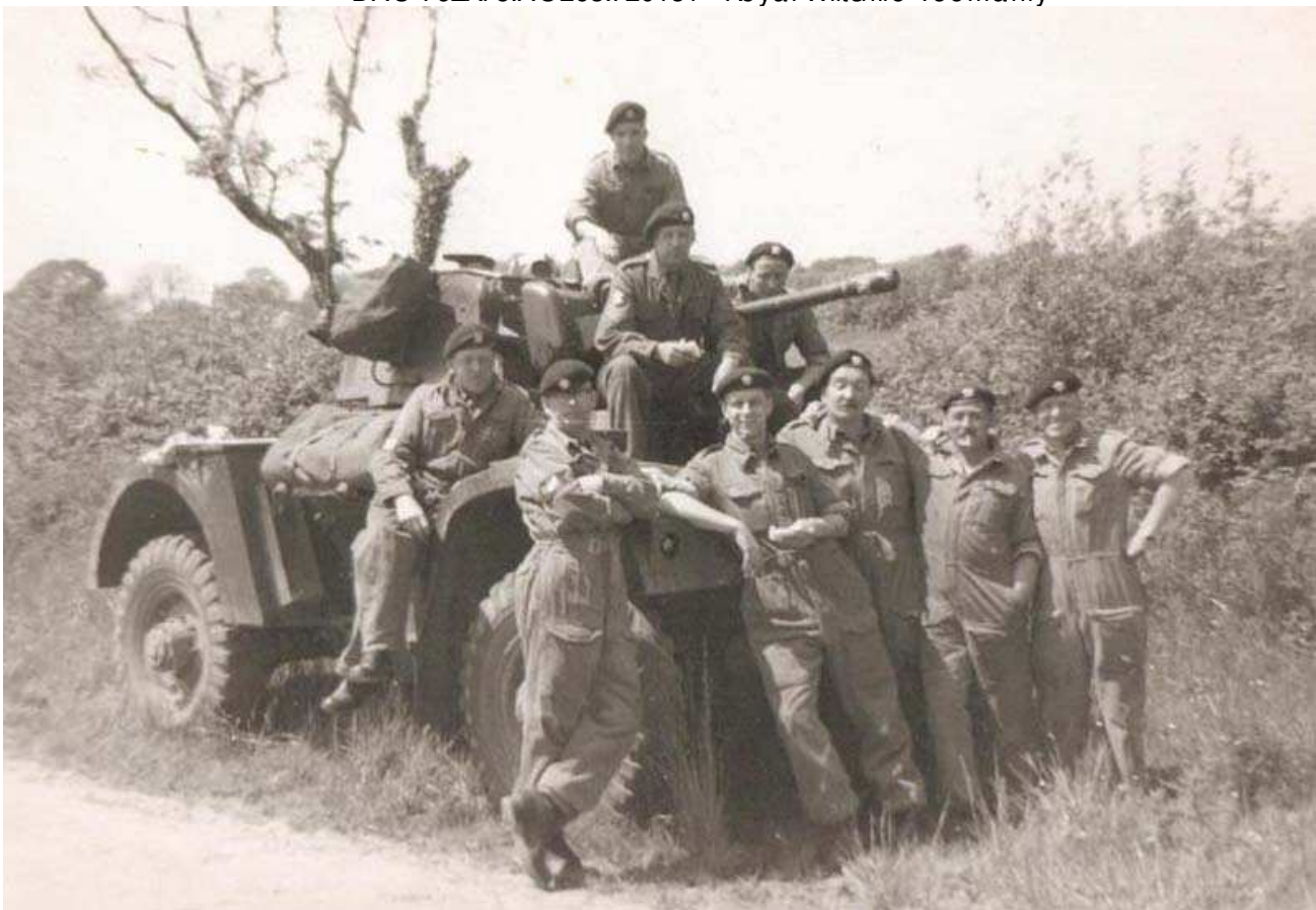
Description: Daimler armoured car crewscirca 1950's