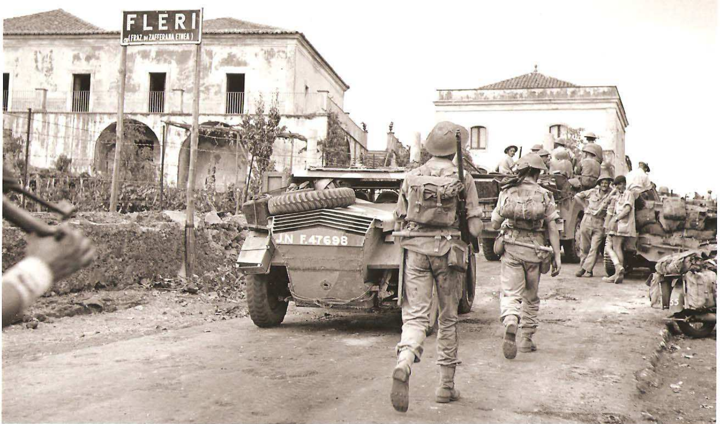
Reference NA5754 Description: Men and vehicles of the 2 nd Wilts Yeomanry Regiment passing through Fleri, including a Daimler Scout car numbered F47698 9 th August, 1943

In July and August, 9th Brigade worked in support of 4th and 10th Indian Divisions in the central mountains south east of Florence, on the approach to the Gothic Line. In August the order was received that all men with over 4½ years service overseas should be repatriated, and this reduced the regiment's strength by half. This made it impossible to function as a fighting unit and it was withdrawn from the line of battle. In October 1944, the regiment returned to England to train reinforcements for armoured regiments still fighting in Europe. It continued in this role until 1946, although the pace slowed after victory in Europe in May 1945.