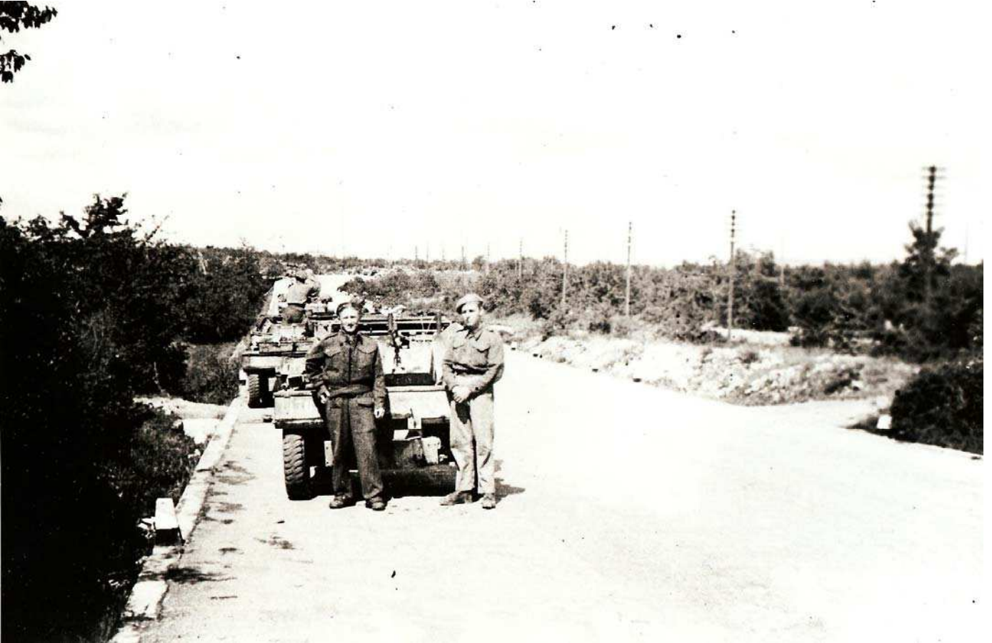
Dingo Scout car and crew of the Derbyshire Yeomanry, date or location unknown

As we 'liberated' each town and village we passed through, Rouen, Yvetot, Yerville, Eretat, Luneray and Fecamp, the inhabitants gave us a tumultuous welcome. They climbed all over the cars, smothering us with flowers and kisses shouting joyously, "Vive la France, Vive la Britain" and many toasts were drunk from bottles of wine, miraculously produced from nowhere! At Luneray the Mayor laid on a civic reception for us where we sat down to roast duck. They made us feel like heroes.