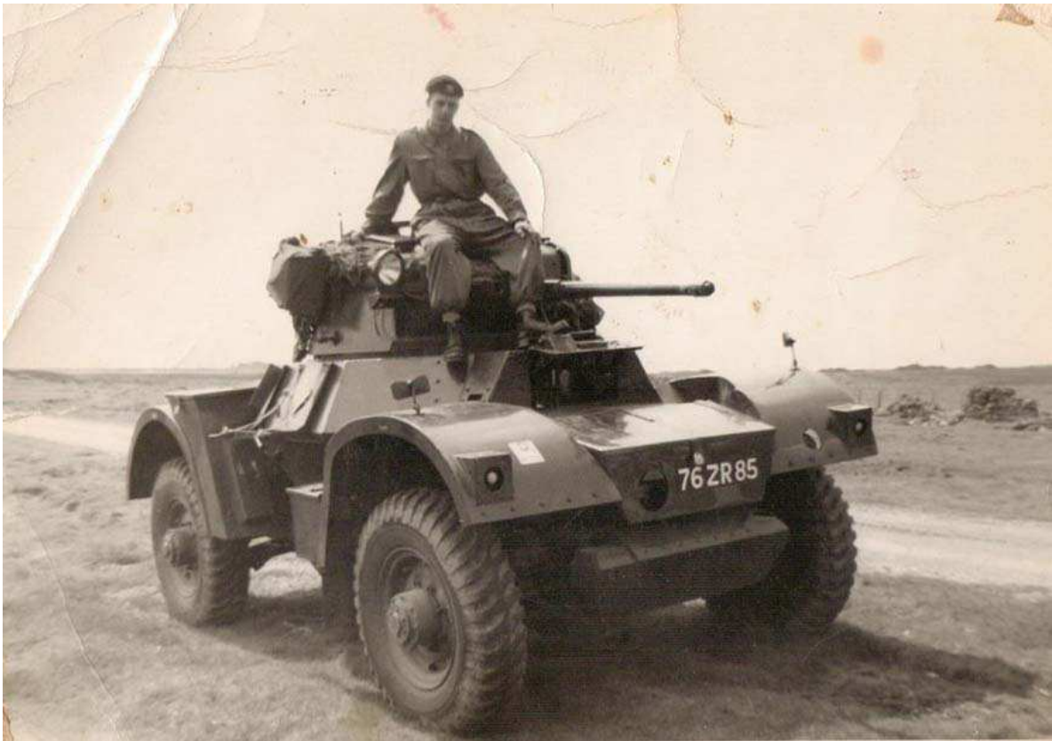
DAC 76ZR75.AC263.F20181 - Royal Wiltshire Yeomanry