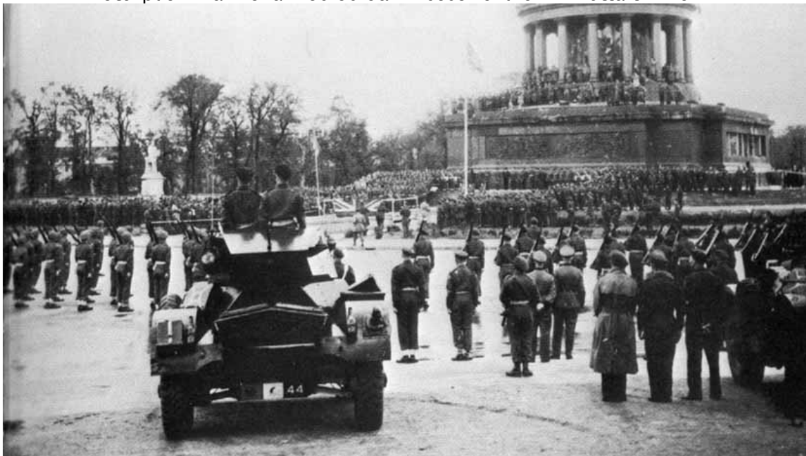
Description: DAC at the Berlin flag Ceremony