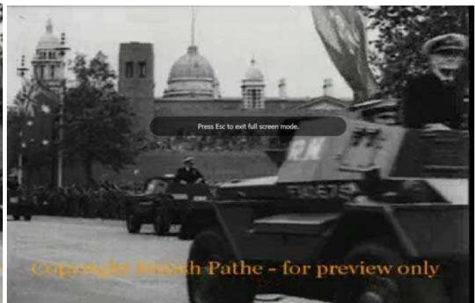
Daimler scout car F340675 with officer from The Royal Navy