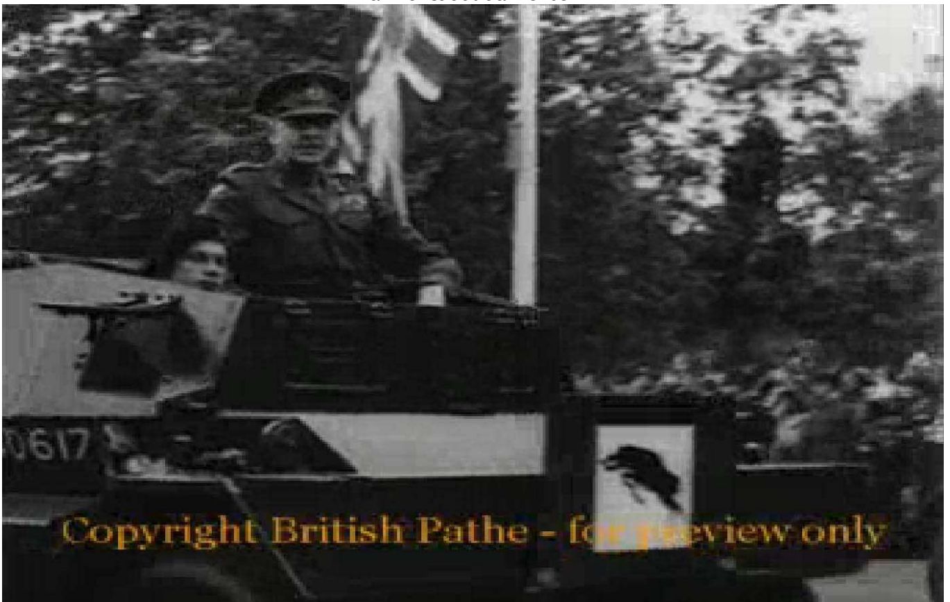
Daimler scout car F340617 with officer from XXX Corps