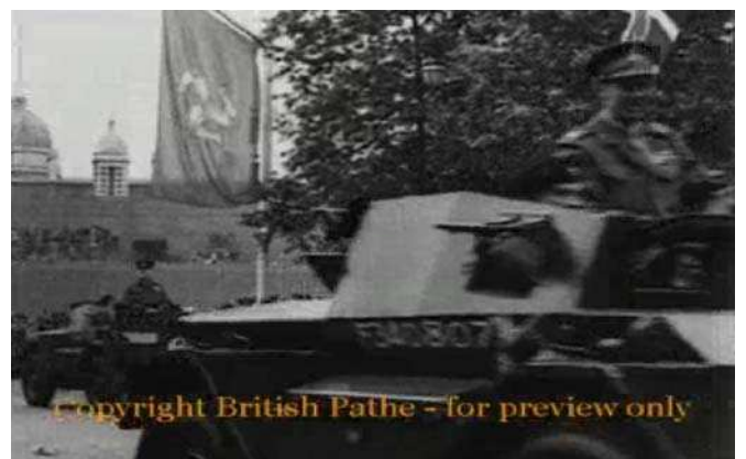
Daimler scout car F340807 with officer from First or Second army group