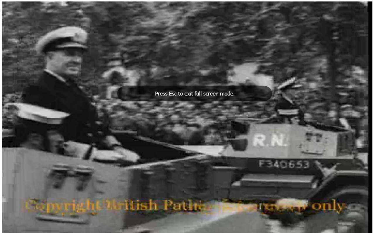
Daimler scout car F340653 with Naval commanders driven by naval ratings - Admiral Sr John Cunningham (no relation to ABC), C-in-C Mediterranean and Admiral Sr Geoffrey Layton of The Royal Navy