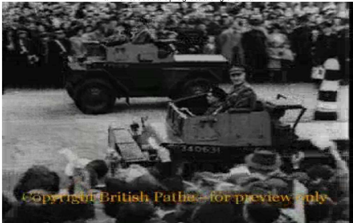
Daimler scout car F340631