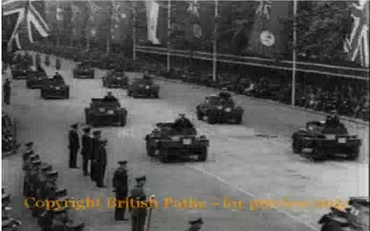
Daimler scout cars progress along the Mall

The London Victory Parade of 1946 was a British victory parade held after the defeat of Nazi Germany and Japan in World War II. It took place on June 8, 1946. The celebration mainly encompassing a military parade starting at three points which converged at the city. The march then proceeded to the Mall where each regiment and service passed the saluting base.