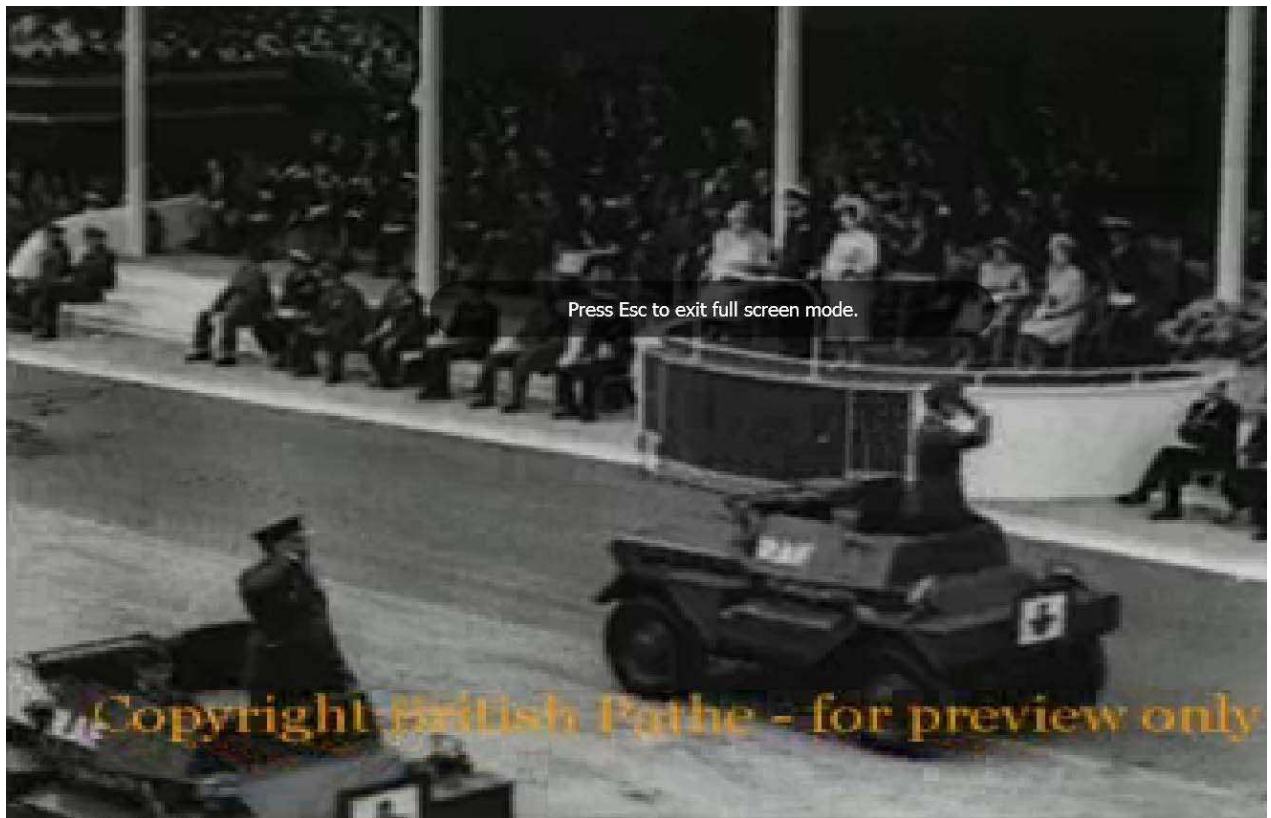
Daimler scout cars with officers from The Royal Air Force