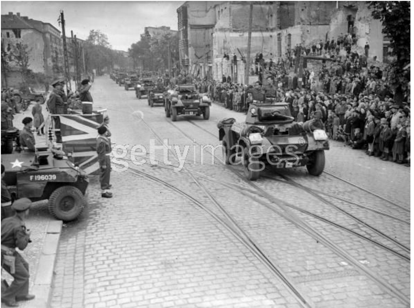
Description: Reputedly the Berlin parade of the 11 th Hussars