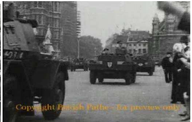
Daimler scout car F340314