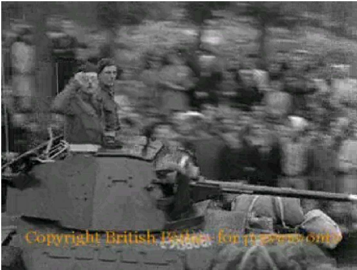
Description: Daimler armoured car F208081 of the 11 th Hussars in Berlin.