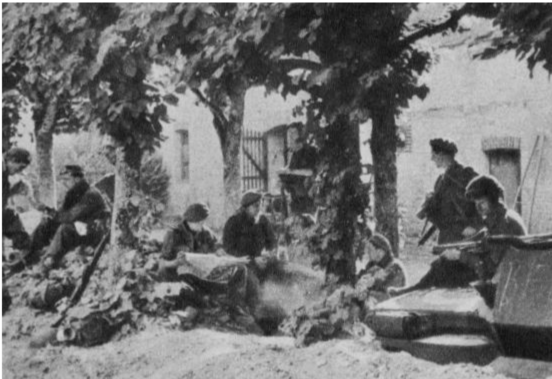
DSC F0000 De Brigade samen met mannen van 6th Airborne Division in het Orne bruggehoofd.