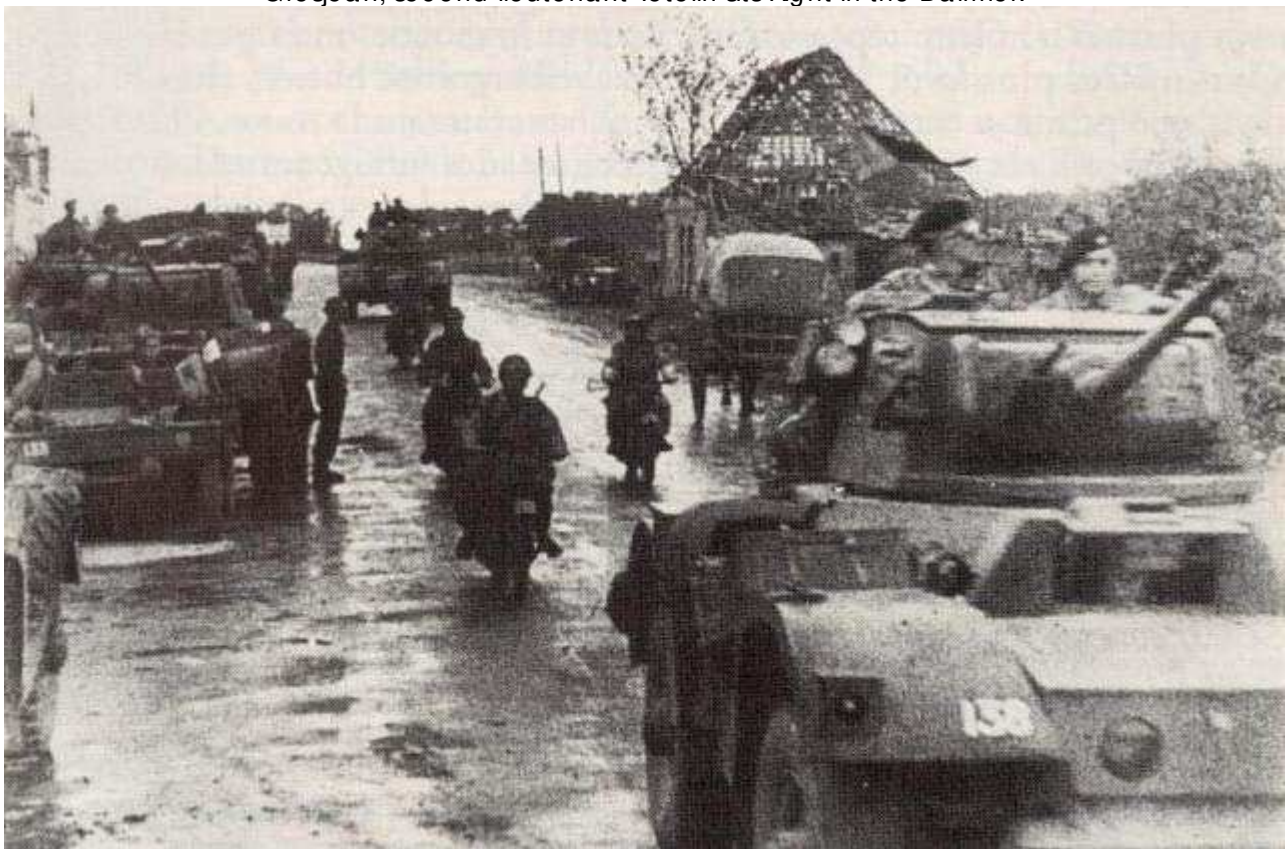
Daimler Scout car in the marking of the Royal Netherlands Brigade - Princess Irene - Brigade reconnaissance battalion