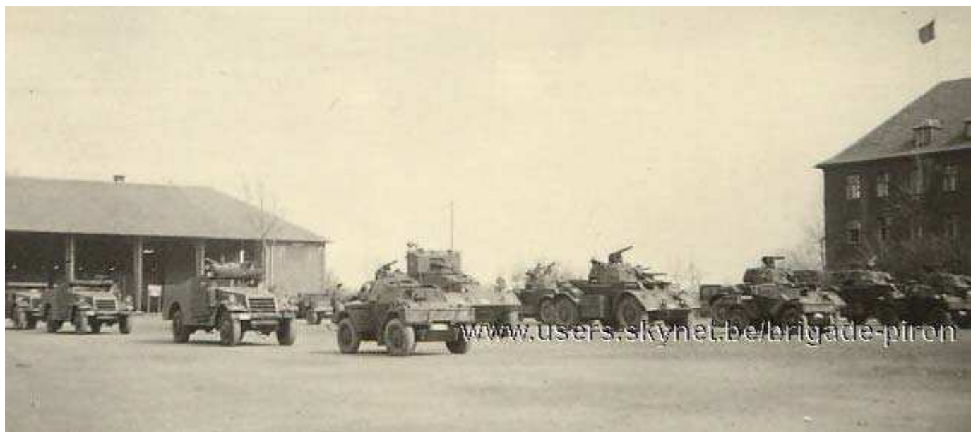
Staghound Armoured Cars White Scout Cars & Daimler Scout cars of the Piron Brigade Formed up