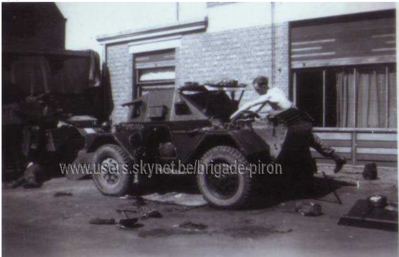
Daimler Scout cars of the Piron Brigade