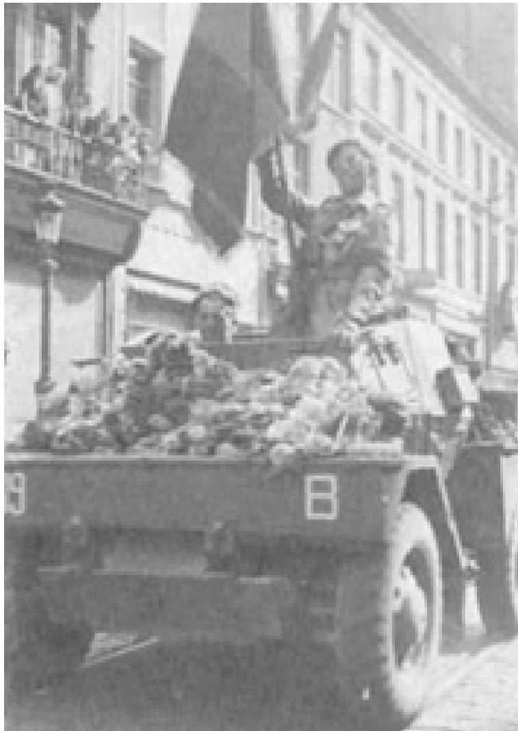
MK 1 Daimler Scout car of the Piron Brigade