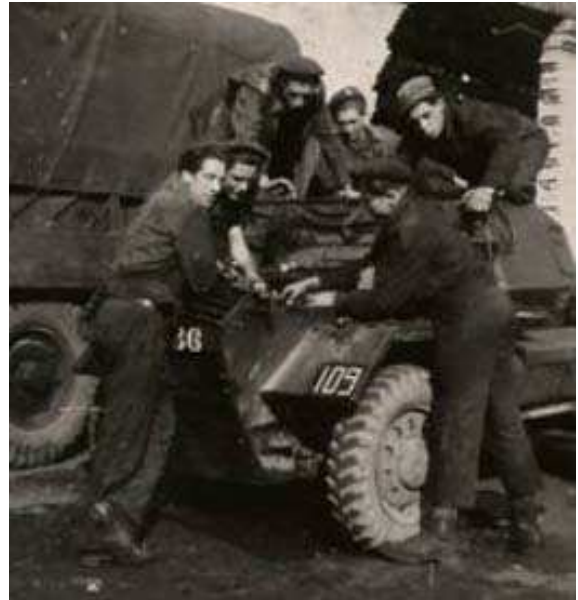
Brigade HQ car being repaired