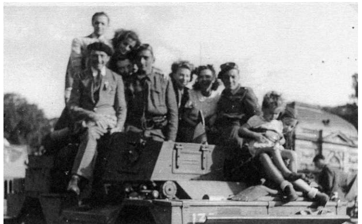
Armoured Car/Reconnaissance Squadron