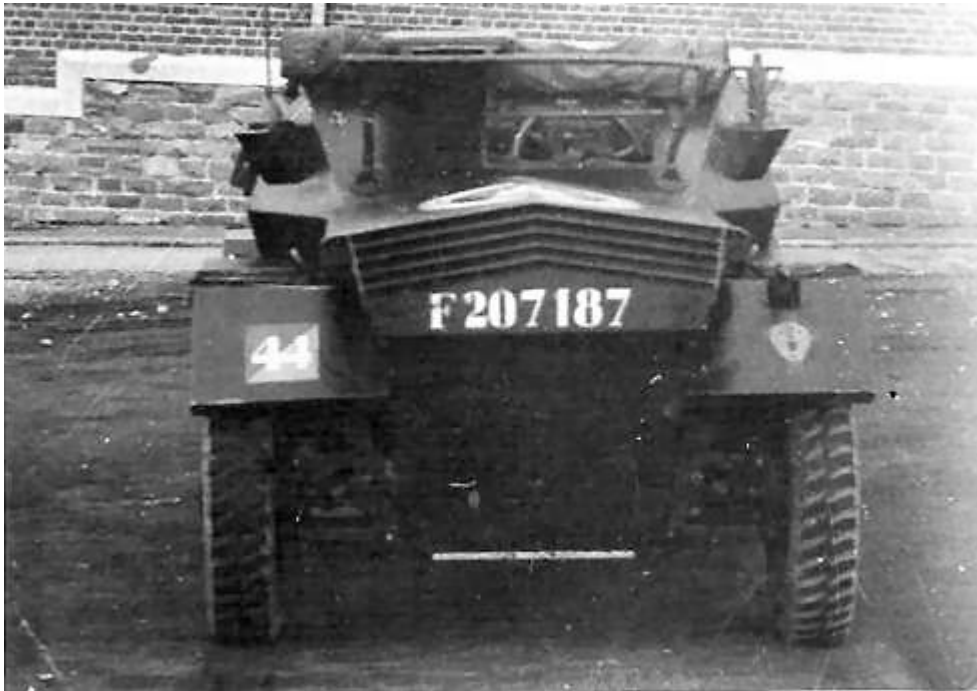
DSC F207187[1]