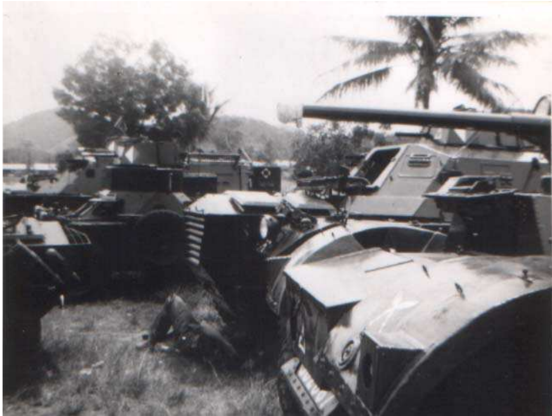
Description: Kenneth Coy trying to get some shade on a mid day stop Circa 1960-62