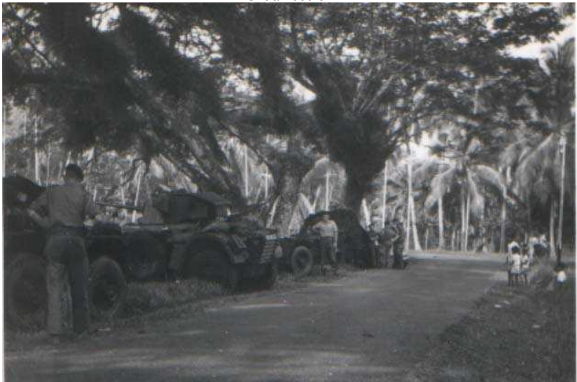
Description: Tea break on road to Singapore. Circa 1960-62