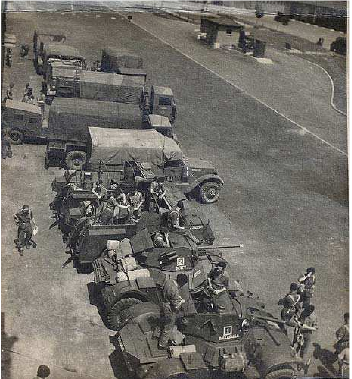
Description: Bsqn 13-18 Royal Hussars QMO, Wolfenbuttel Circa 1947