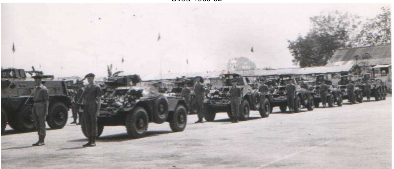
Description: C Sqd arriving back at Ipoh after 2 years at Gapis Circa 1960-62