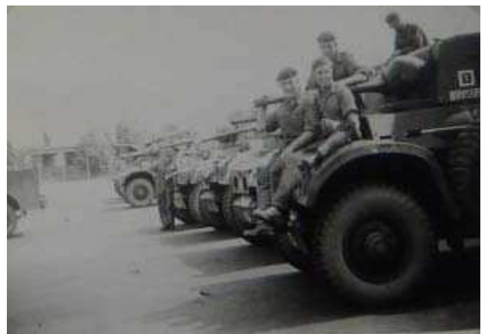
Description: B sqn 13-18 Royal Hussars BOAR. Circa 1953-54