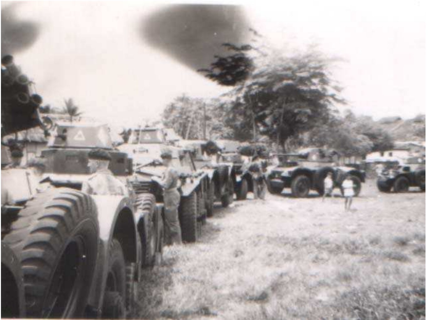
Description: A Squad on route to KL Circa 1960-62