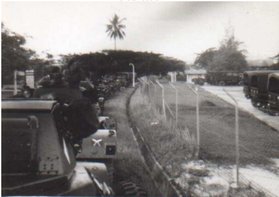
Description: On the road to KL for the victory parade Circa 1960-62