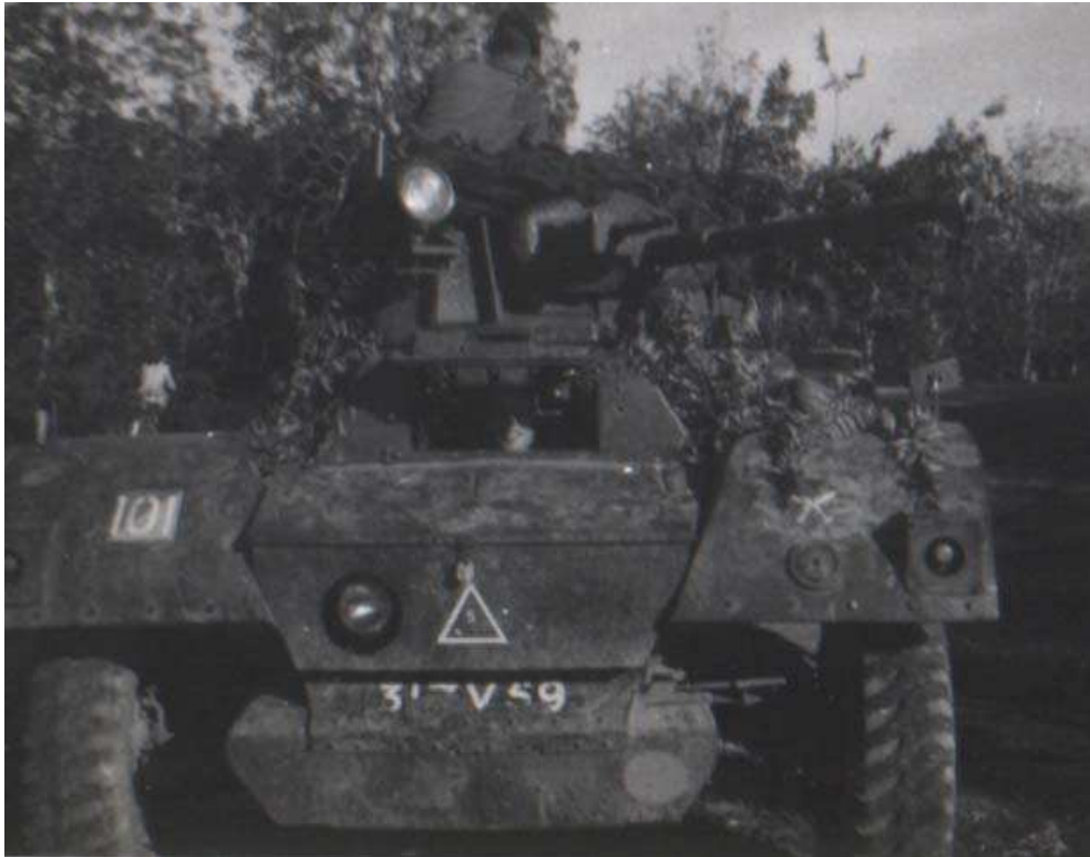
Description: Rest for the night on patrol Circa 1960-62