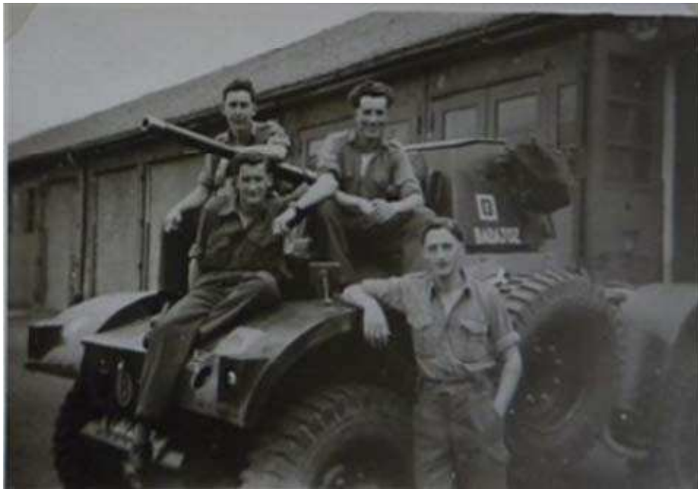
Description: Dingo F206552 / 01ZS77 of the 13-18 Royal Hussars BOAR. Circa 1953-54