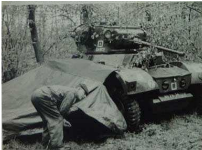
Description: Daimler armoured car F208017 / 08ZR74 of the 13-18 Royal Hussars BOAR. Circa 1953-54