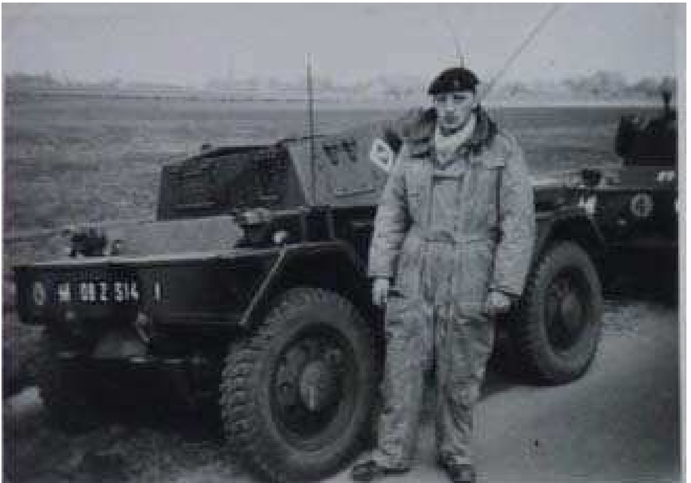
Description: Dingo F48001 / 08ZS14 of the 13-18 Royal Hussars BOAR. Circa 1953-54