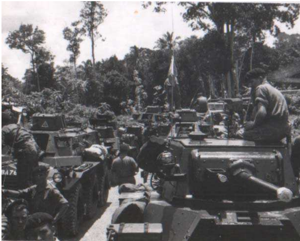
Description: Squadron waiting to cross river Circa 1960-62