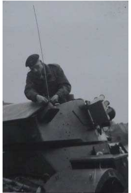
Description: B sqn 13-18 Royal Hussars BOAR. Circa 1953-54