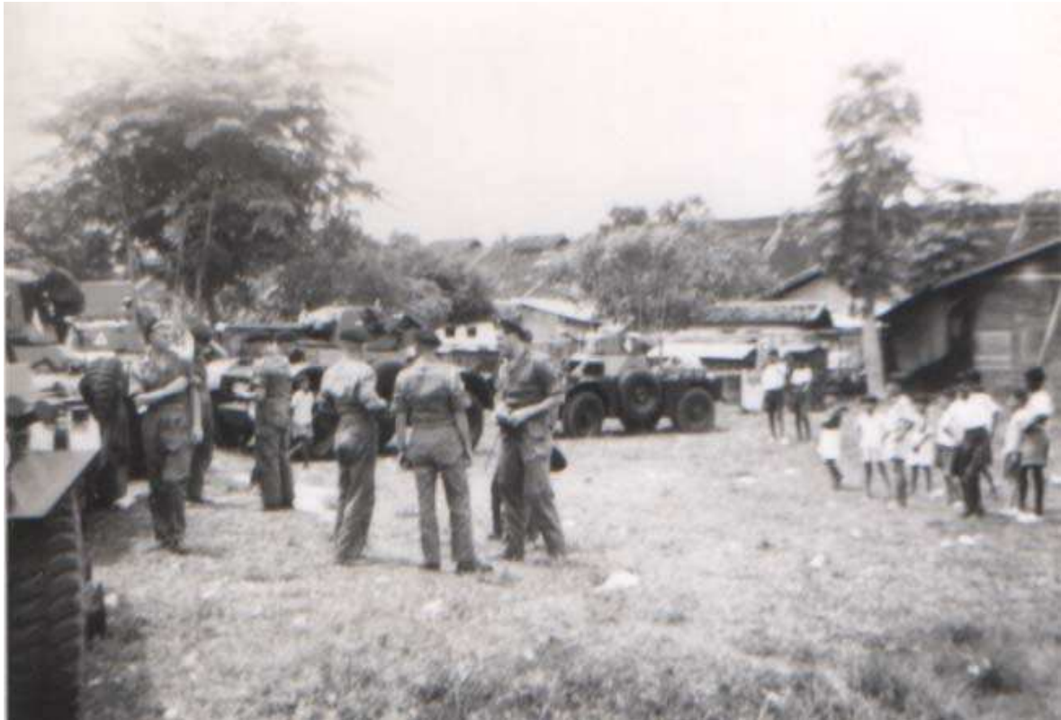
Description: Stop of at village on route to east coast. Circa 1960-62