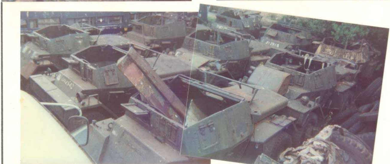
Description: Mc Canns scrap yard, in Poole Dorset Date: 1976