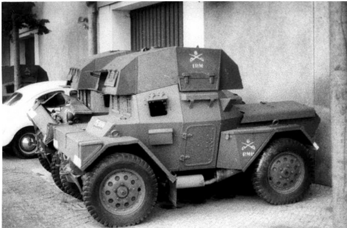
Description: Dingo's that have served with the Portuguese. The odd turret arrangement was a local modification. Date: unknown