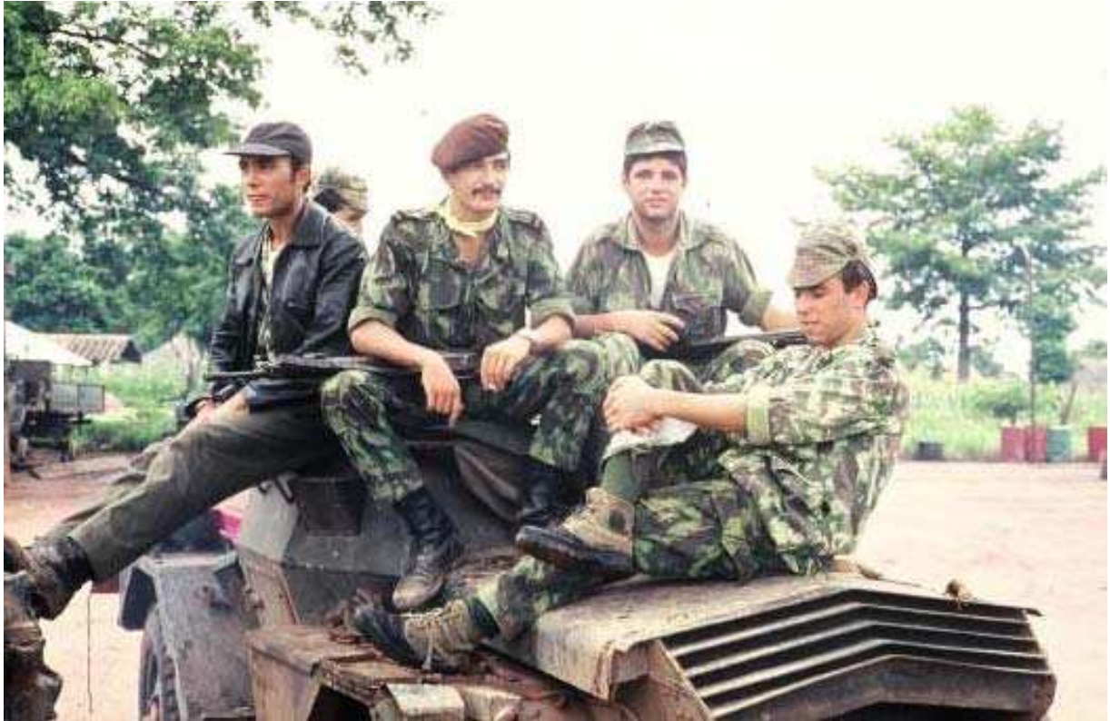
Description: A dingo in Portuguese New Guinea Date: circa 1970's