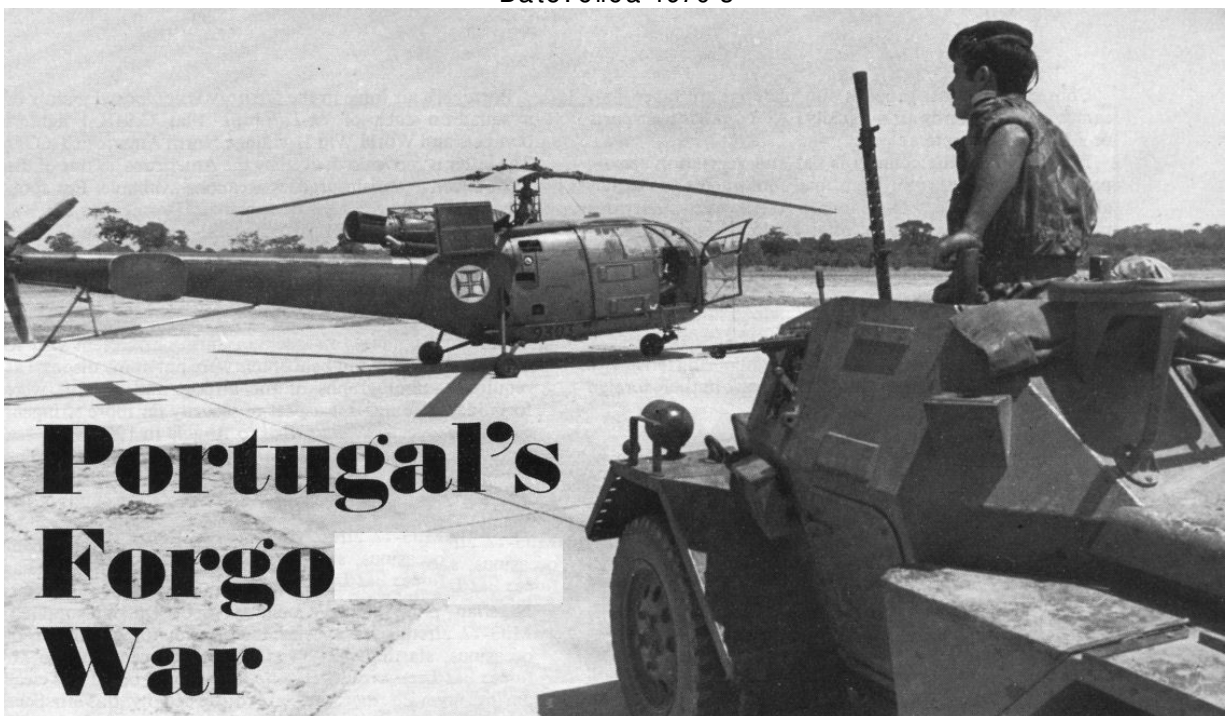
Description: A dingo in Portuguese New Guinea Date: unknown