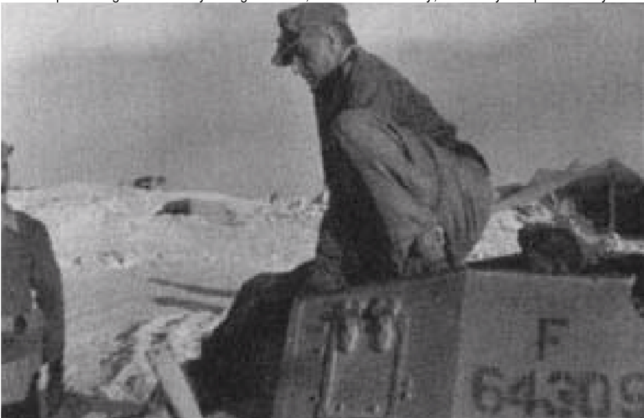
Description: Dingo F64309 General Von Thoma, Commander of The Afrika Corps was captured by Captain Grant Snger