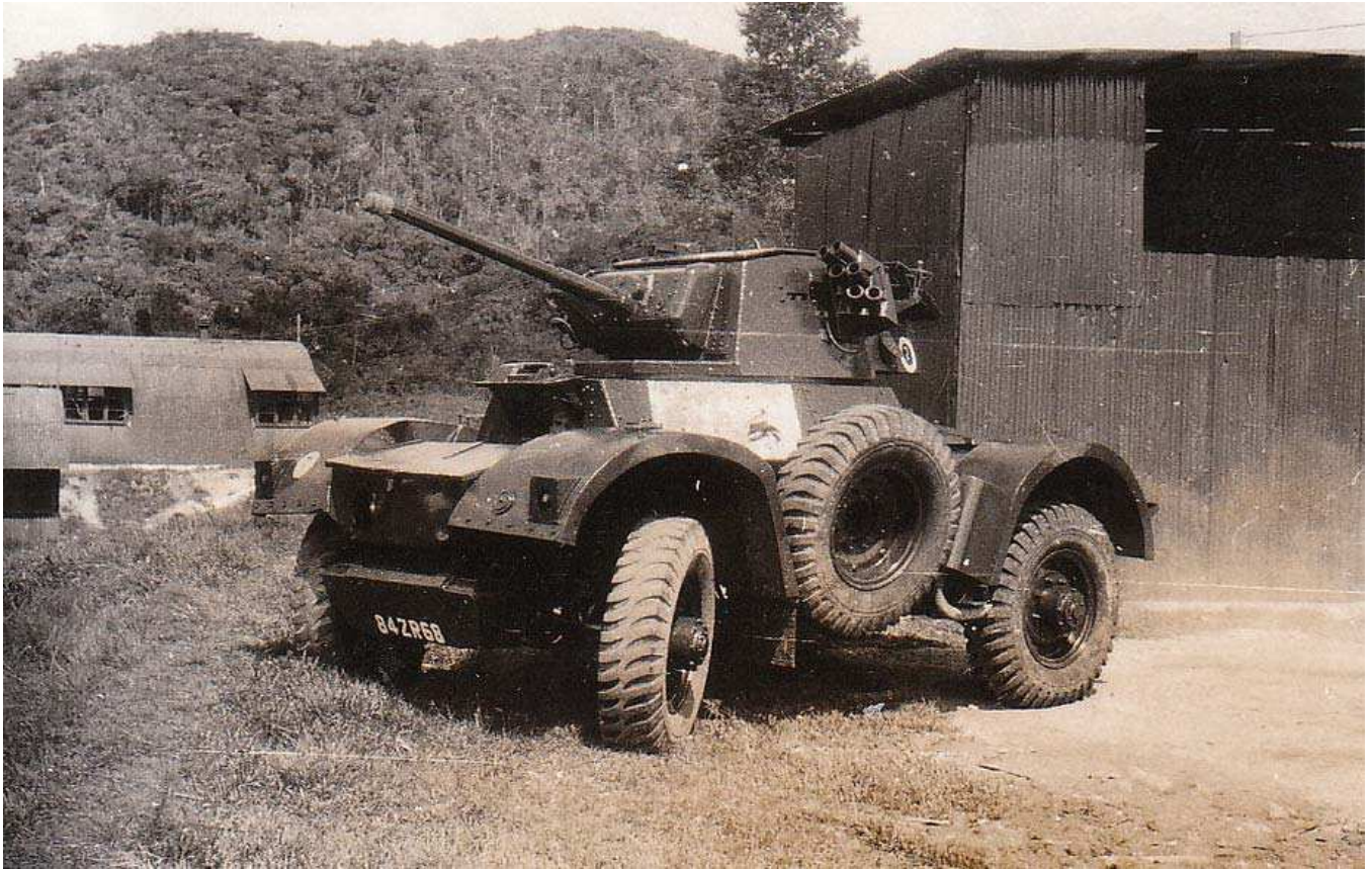
Description: DAC F117499/84ZR68 daimler in camp at the cameron highlands Malaya 1955