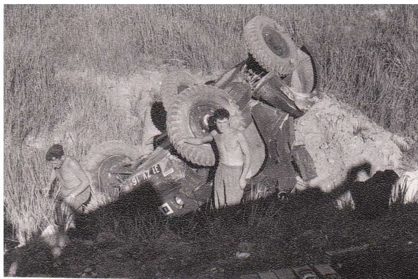
Description: Attempting to recover overturned daimler 31ZV16 of B Squadron. Note the BESA ammunition boxes removed from the vehicle. Malaya 1957