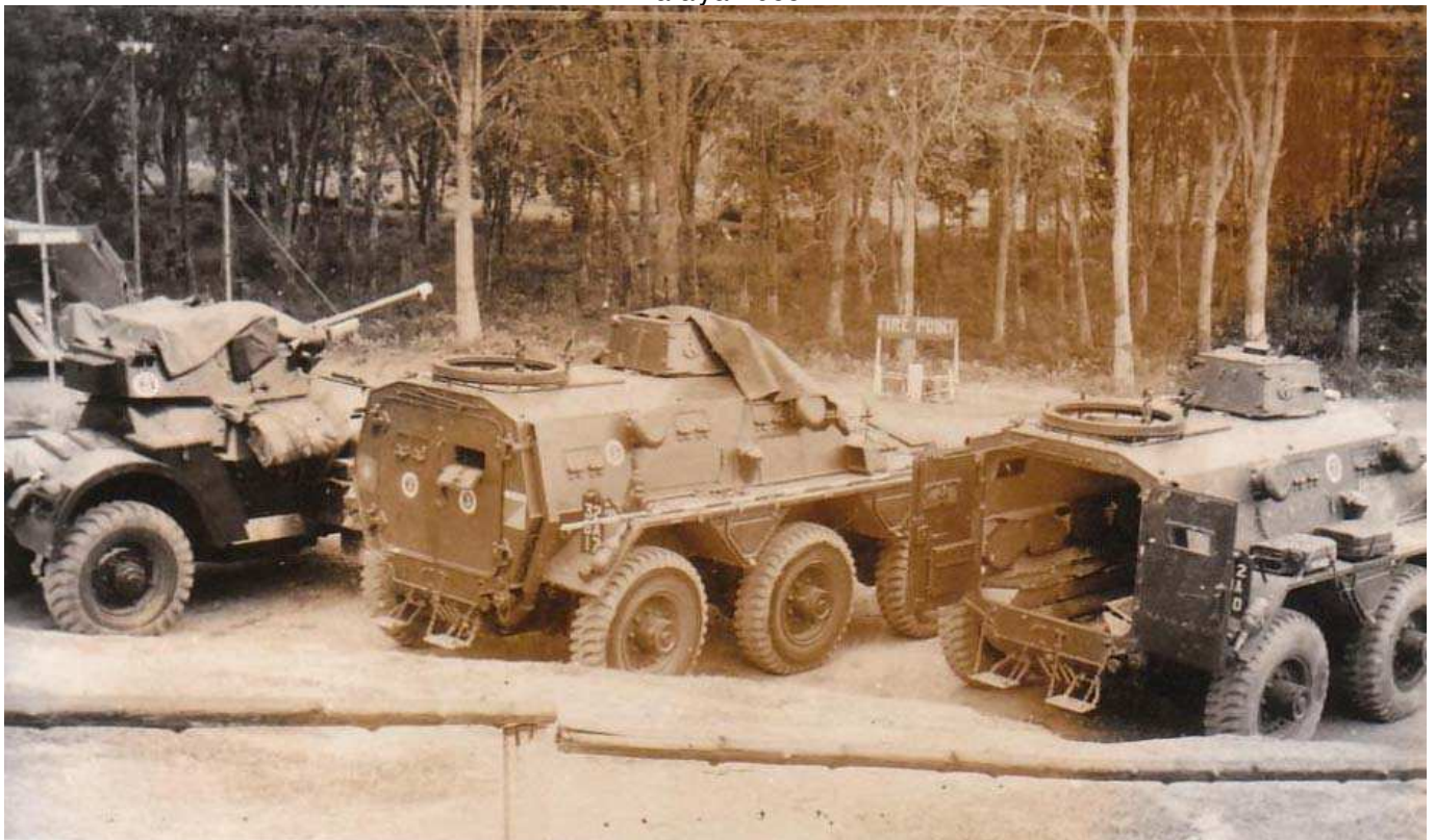
Description: Saimler and Saracens of C squadron at Kulim. Malaya 1956