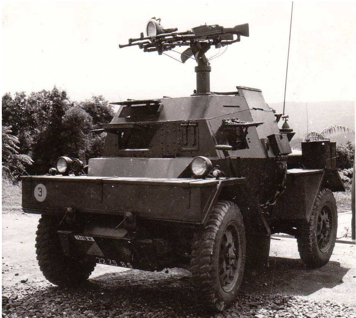
Description: Daimler scout car (dingo) F329773/227585 of C squadron at the Cameron Highland Malaya 1956