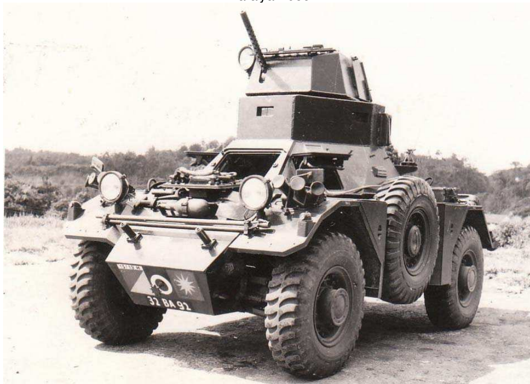
Photo courtesy of Trooper Fred Pascoe C squadron Ferret at the Cameron Highlands 1957 Malaya 1956