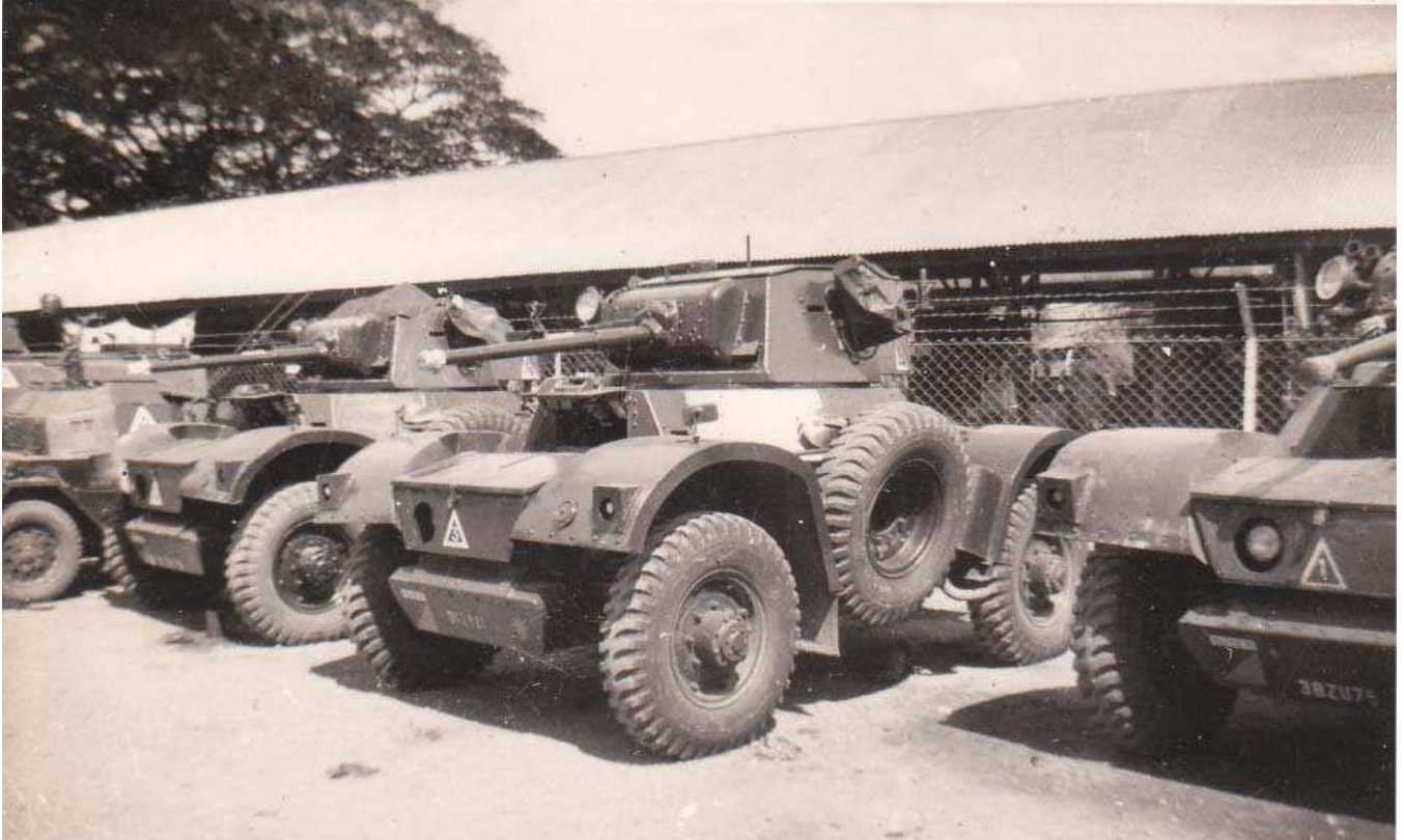
Description: DAC's f19974/38ZU75 & others of 1st troop A squadron of the 15-19 Hussars at Raub, Malaya 1954