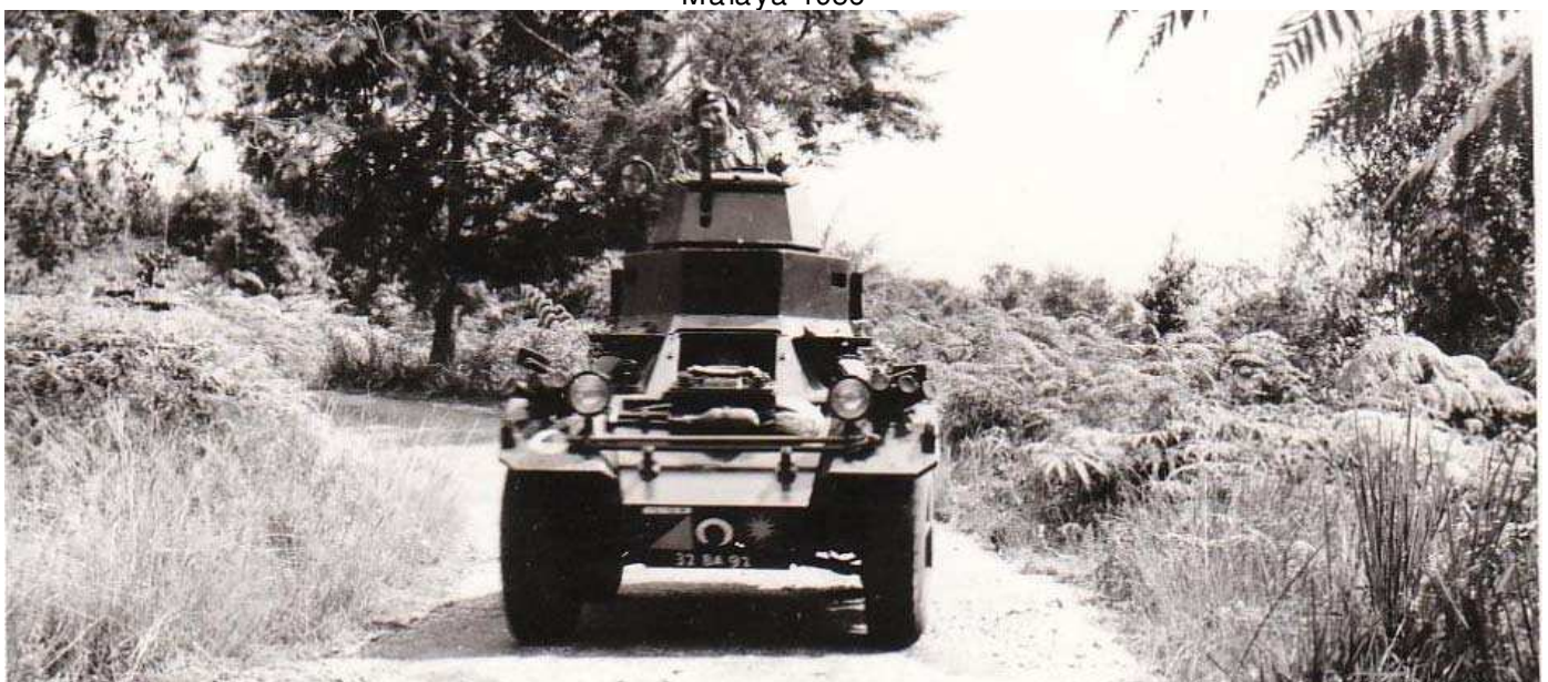
C squadron ferret on approach road to camp Malaya 1957