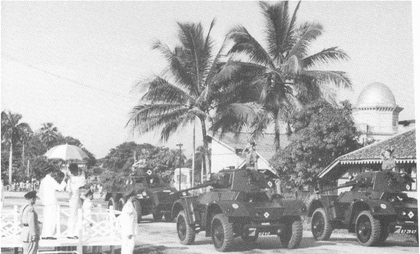
Description: Escort for Lady Dorothea Head – Malaya Humber, DAC 31 ZV 17 & 87.ZR.47 are visible