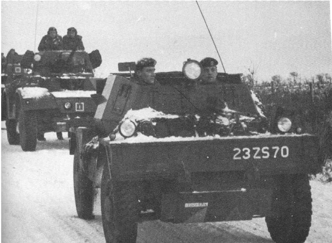
Description: DCSF340461/23 ZS70 on the first snow patrol in Armagh