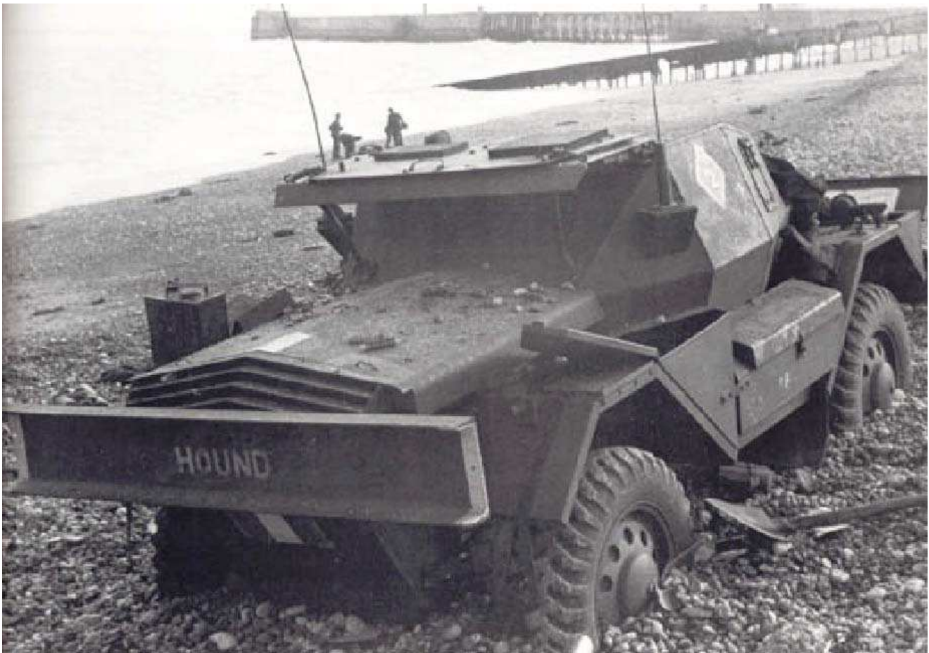
2nd HQ car named HOUND, F64304, Photo sourced from the internet Photographer : Unknown

They were also unable to communicate directly with those on the shore to make their bombardment effective.