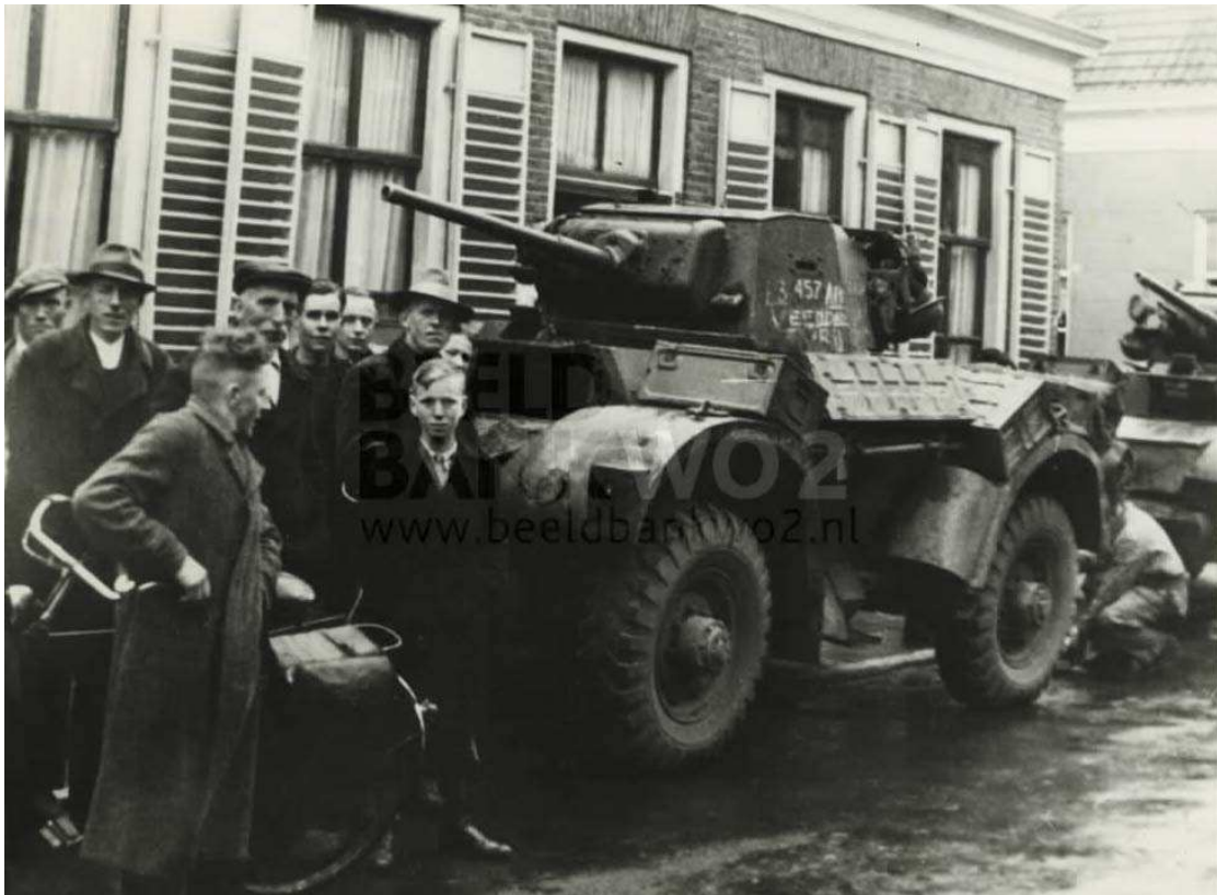
Description: 8th Recce of the 14th Royal Canadian Hussars in Noordbroek Date: circa 1945.