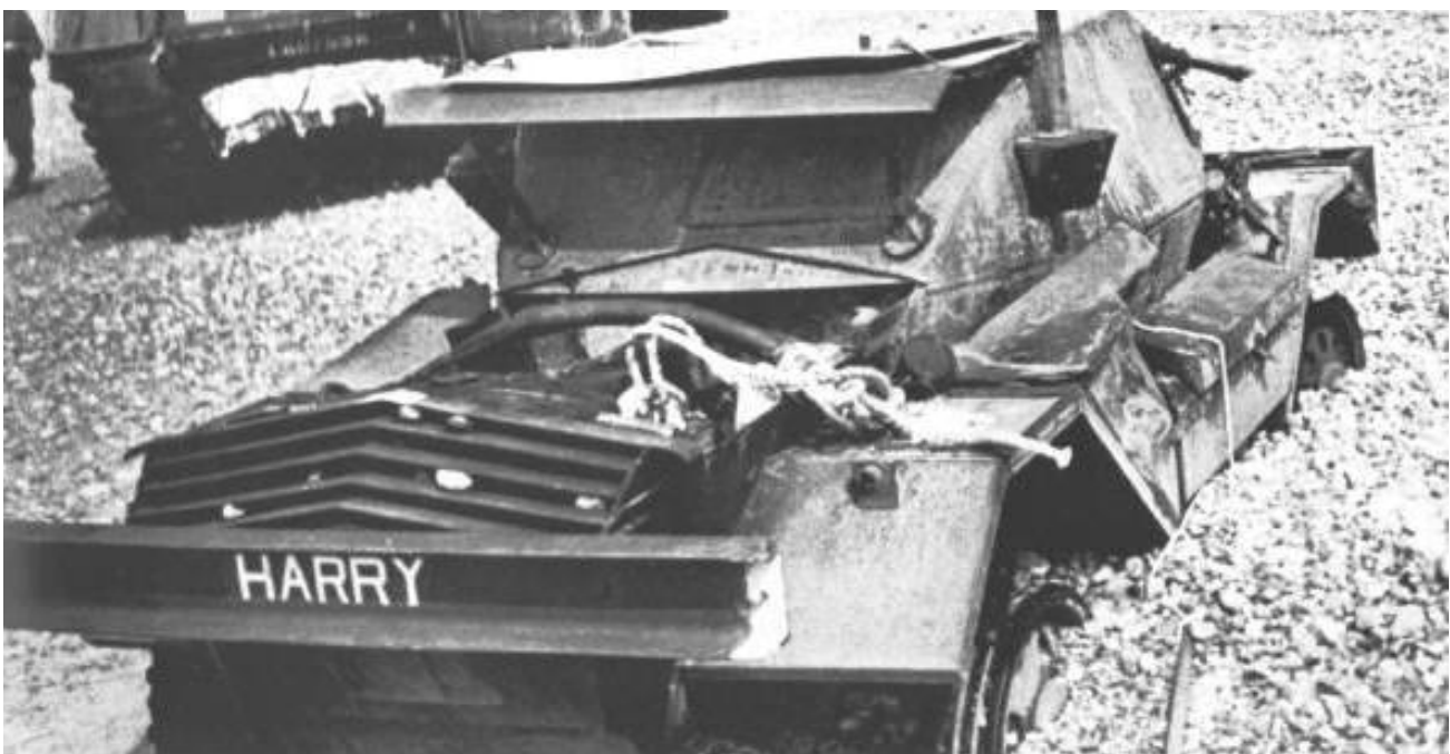
Description: The 7th HQ dingo named HARRY, F????? after the raid. Date: Sept 1942

The western assault gained a hold in a shore-front casino but few soldiers made it across the road and they were soon held.