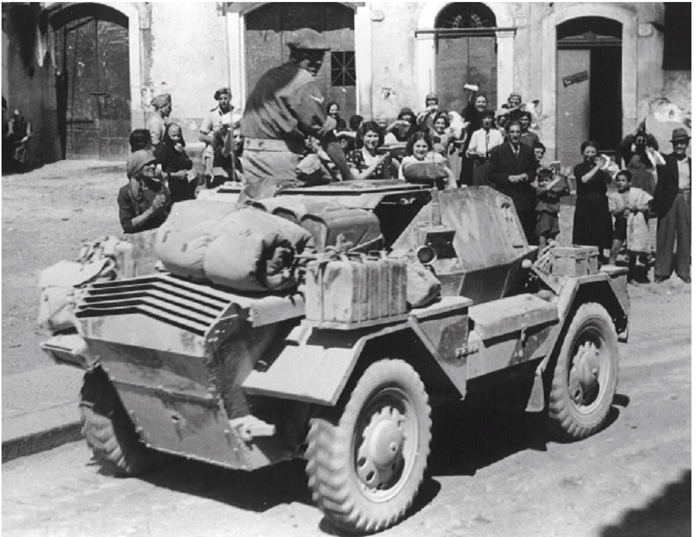
A Scilly