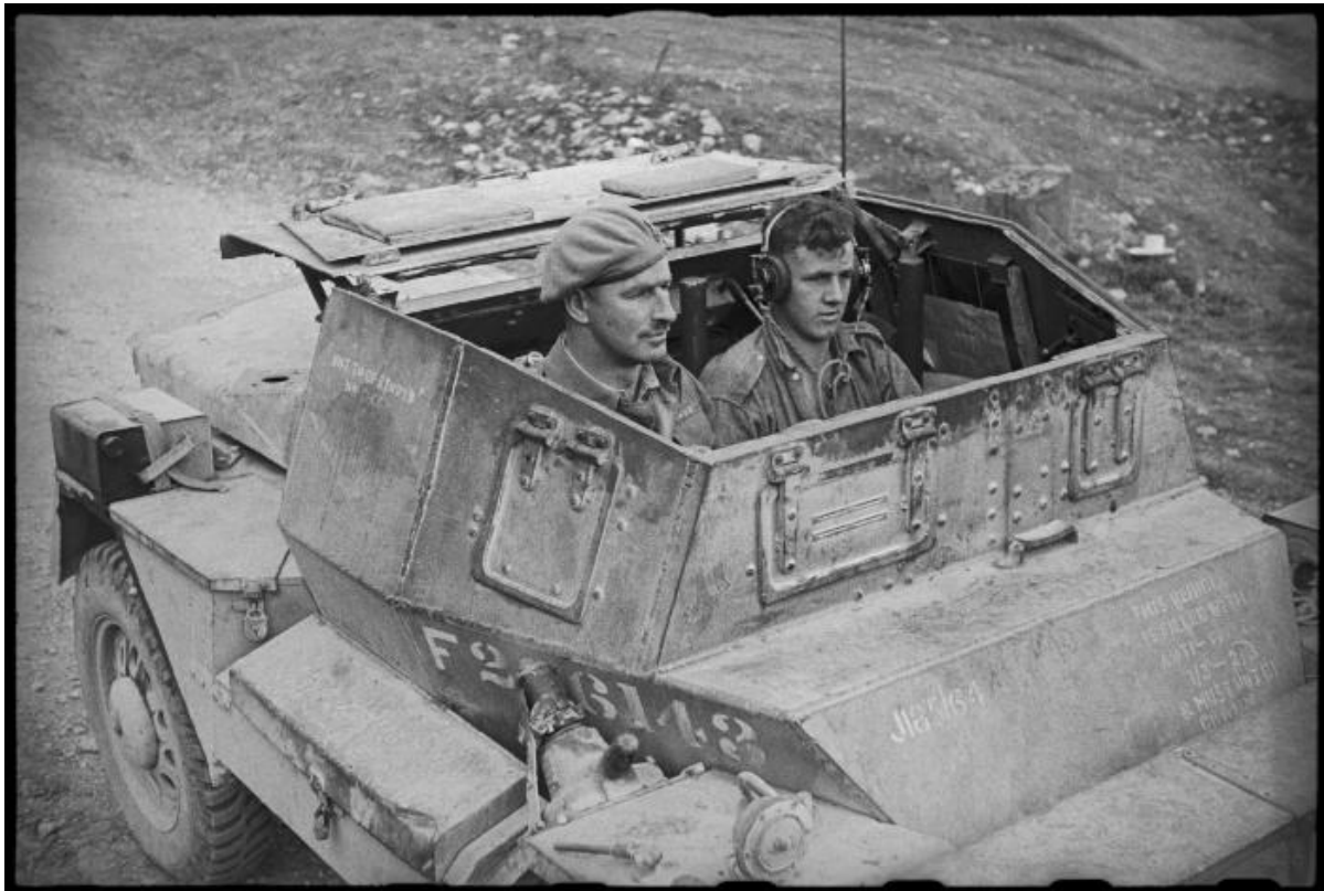
Description: Brigadier Cyril Weir in his dingo about to visit NZgun positions in Voltorno Valley area, Italy, 11 May 1944.