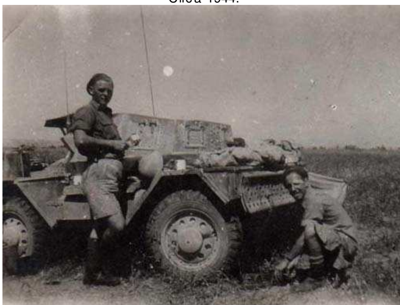
Description: Unidentified troopers prepare a meal.