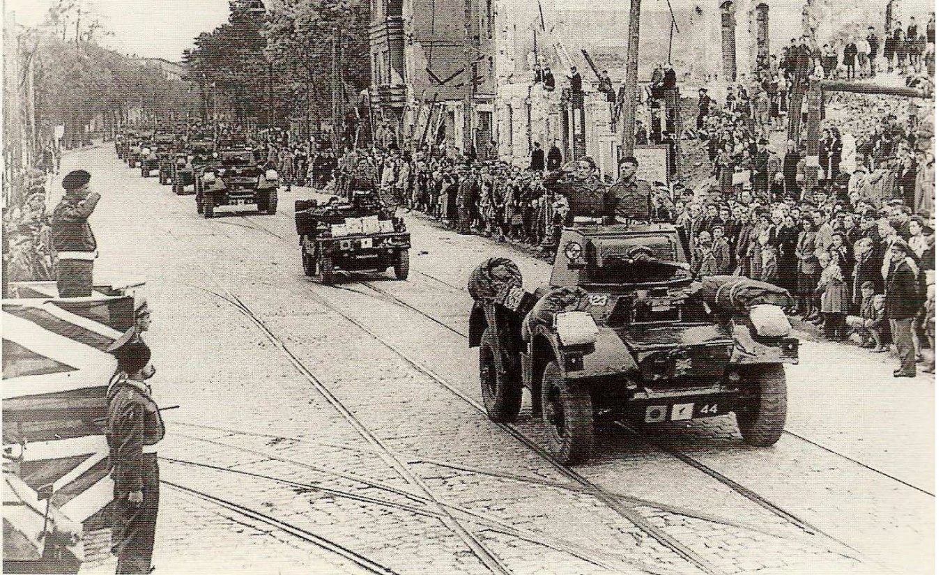
DESCRIPTION: C Squadron lead the regiment into Berlin 12 th may 1945.