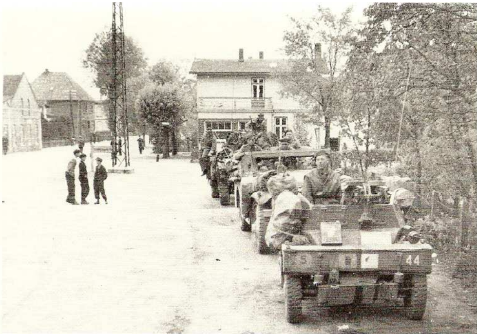
1st Troop D Squadron ready to move. The second vehicle is a White Scout Car. These vehicles were used to carry small sections that could fight if required in a dismounted role. They were very useful for foot reconnaissance patrols, clearing mines and for outflanking enemy positions. They were either attached to troops or concentrated under the control of squadron headquarters