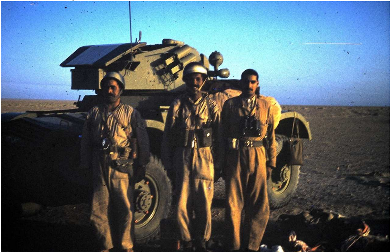
Description: The 11th Hussars were equipped with Ferrets & Saladin's in Kuwait. The local Troops were equipped with 20 year old Daimlers. Date Circa 1960