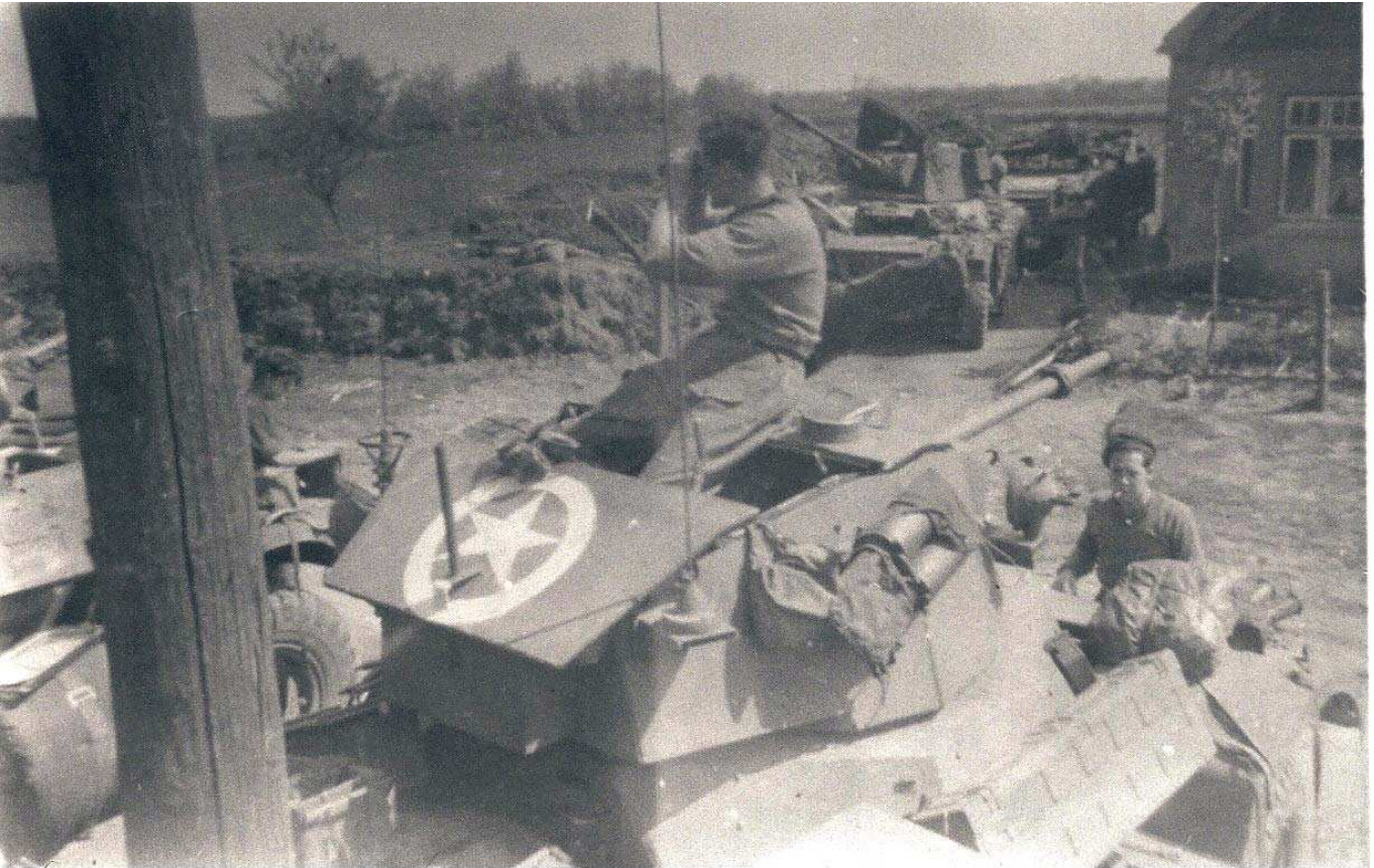
A Daimler Armoured Car of 11 Hussars, fitted with a little john adaptor. Circa 1944