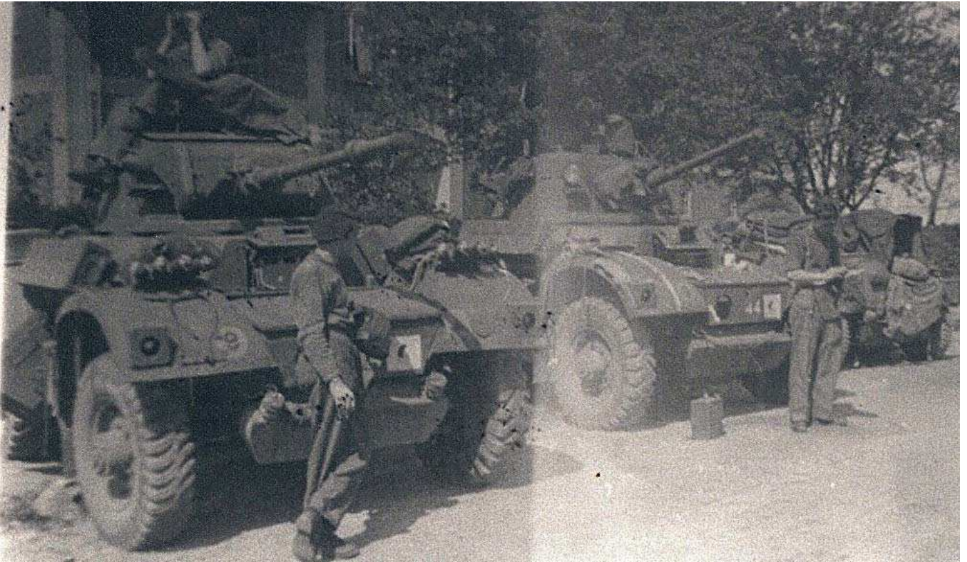
Description: Daimler armoured car 11 Hussars PAO, D Squadron Date: circa 1944.