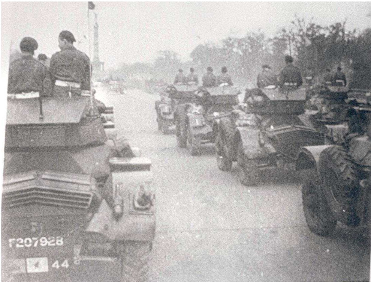
Description: Daimler armoured car F207928 of the 11 Hussars PAO, Victory Parade Berlin 13 th May 1945.