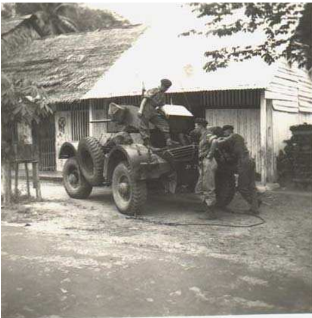
Breakdown on the way back from Konkoi to Paroi.