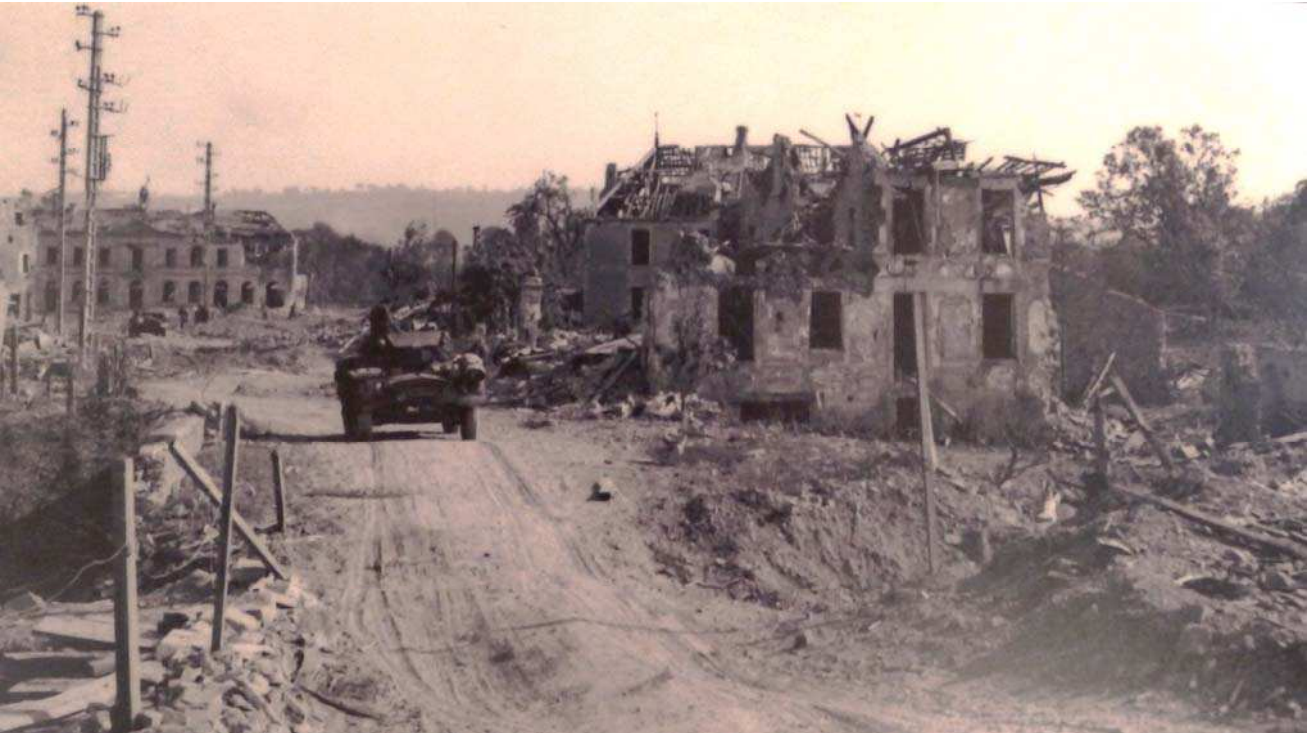
Image sourced by Ferdinand Vanden Boomen from a photo on a wall in de Bayeux memorial museum. Description: The 11th Hussars pass through the devastating scene at the village of Aun-sur-odon, South of Villiers Bocage (south west of Caen).

The whole city was bombed by the RAF on 14 th of June to cover the noise of withdrawing British vehicles (Operation Anisæed).