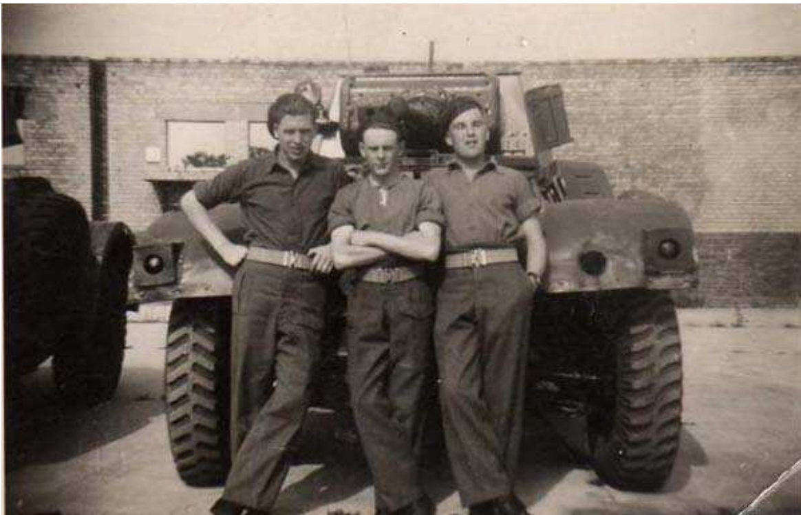
Description: Daimler armoured car 11 Hussars PAO, D Squadron, crew Date: 1944.