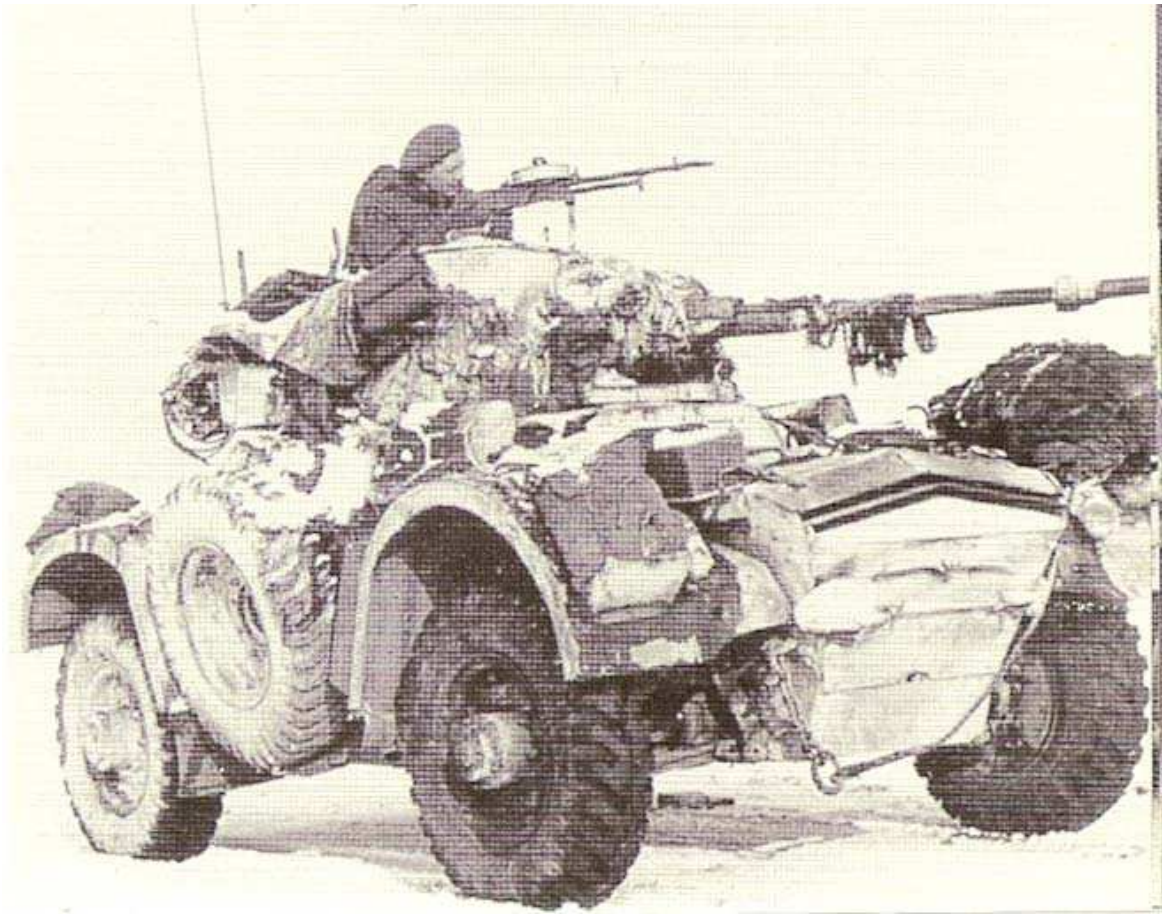
Title: THE BRITISH ARMY IN NORTH-WEST EUROPE 1944-45 Description: Daimler armoured car of D squadron at buchen Christmas 1945