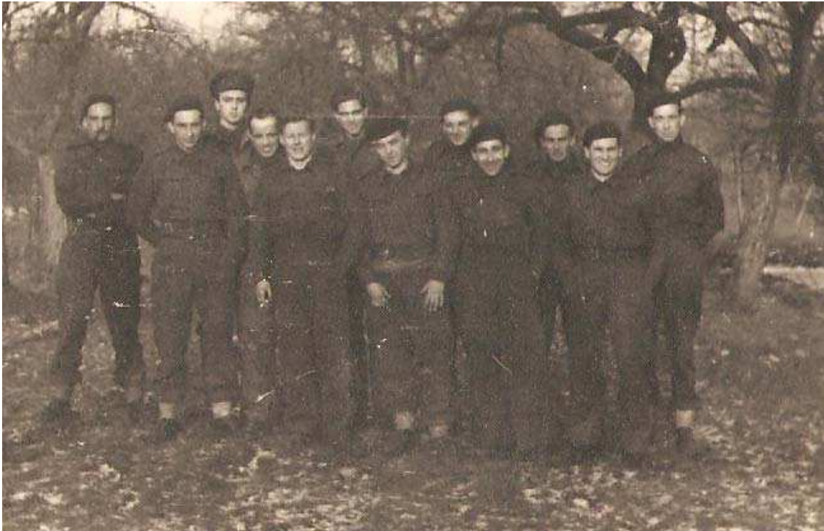
Description: Happy troopers celebrate Christmas 1944 Date: June 1944.