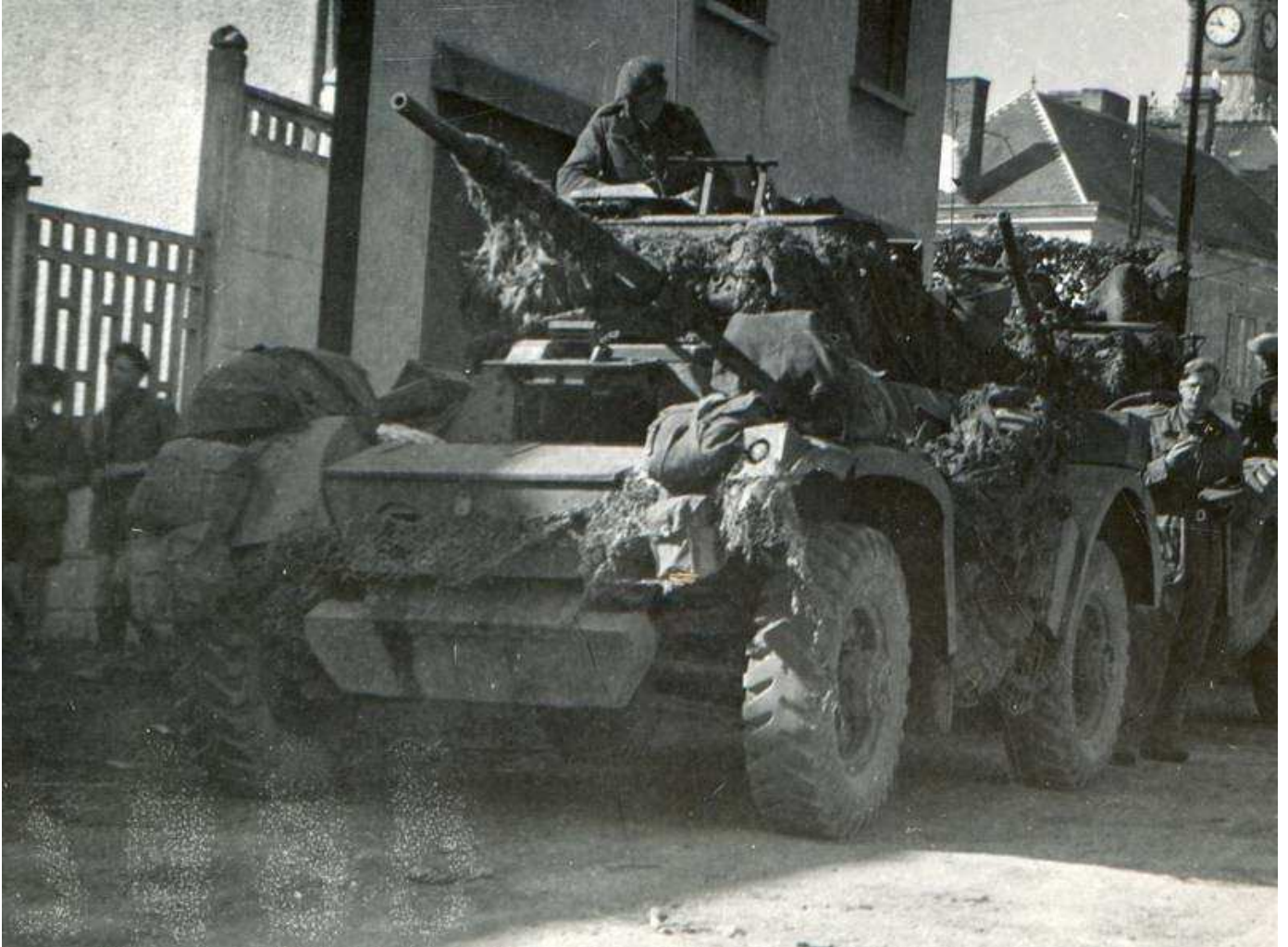
Description: 11th Hussars, Liberation of Mollens Vidame on Date: 1st September 1944