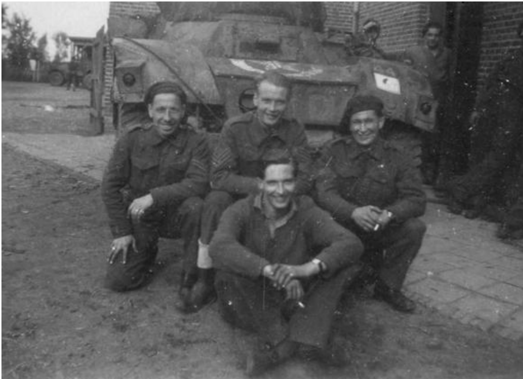
Description: Daimler armoured car 11 Hussars PAO, D Squadron ,crew, presumably the driver is in the front with commander on left and gunner on right with troop leader central. 1944.