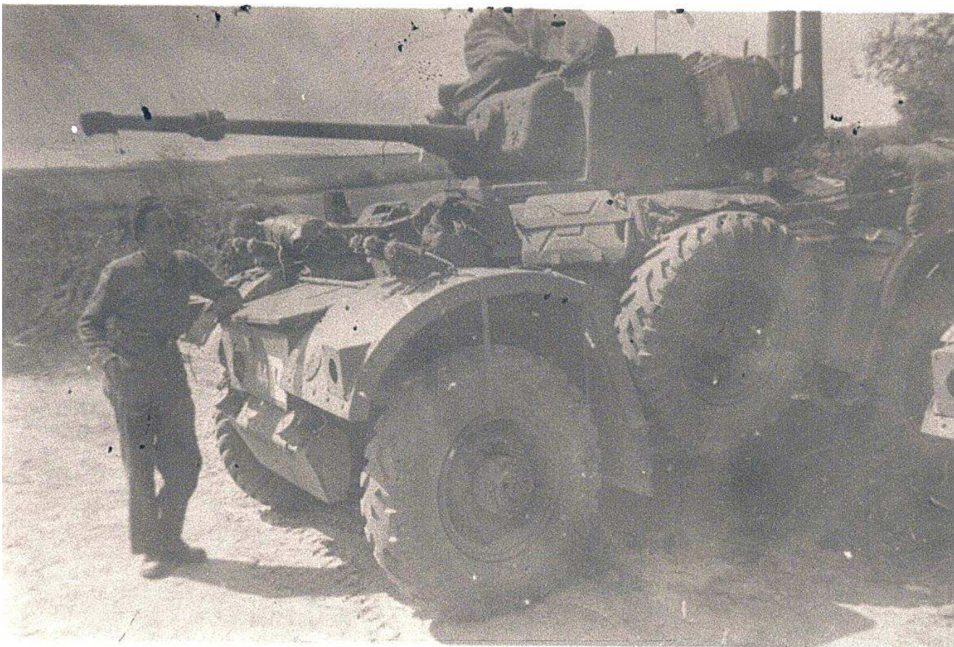
Description: Daimler armoured car 11 Hussars PAO, D Squadron Circa 1944.