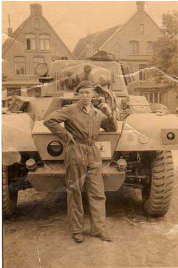
Description: Daimler armoured car 11 Hussars PAO, D Squadron Date: circa 1944.