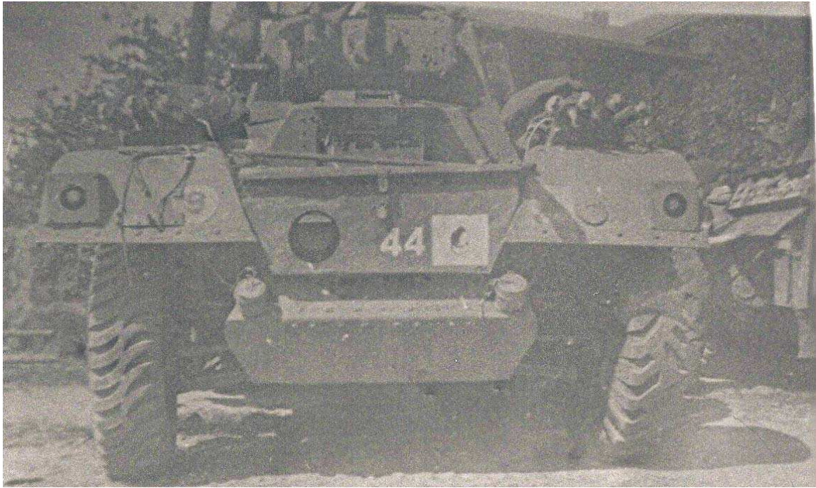
Description: Daimler armoured car 11Hussars PAO, D Squadron Circa 1944