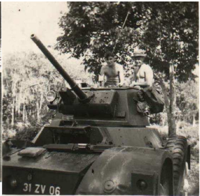
Konkoi November 1954