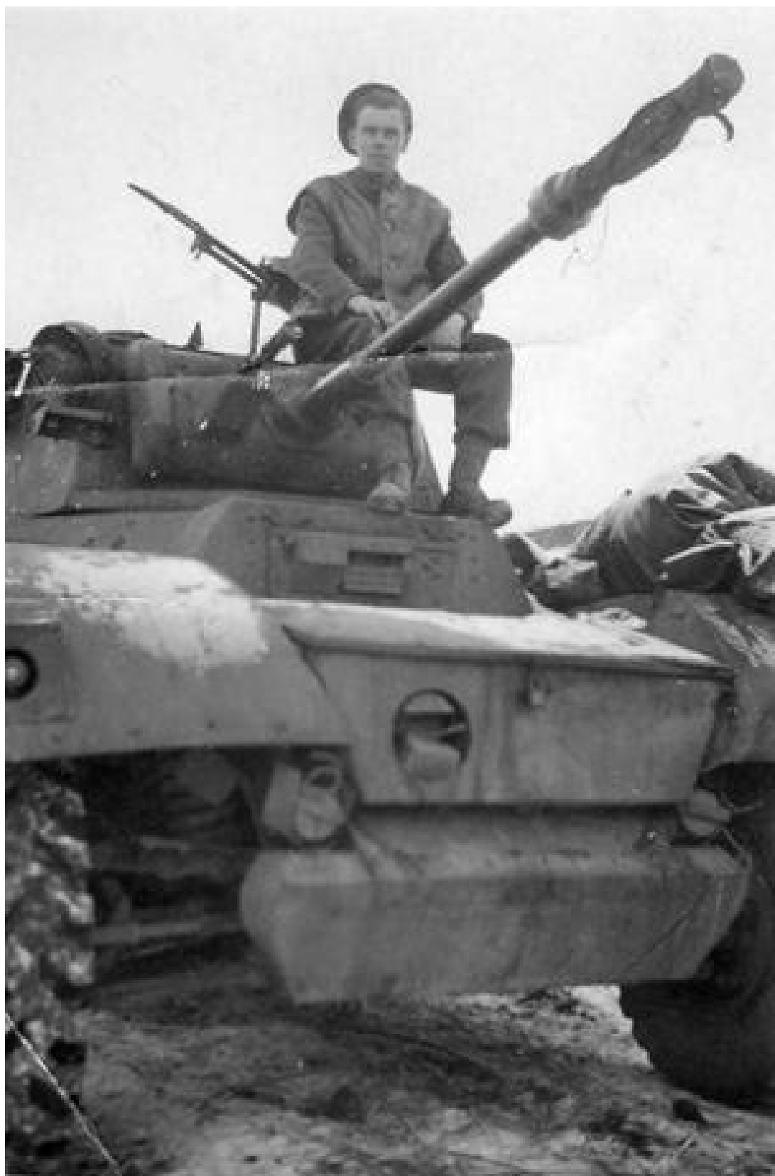
Description: Daimler armoured car 11 Hussars PAO, D Squadron