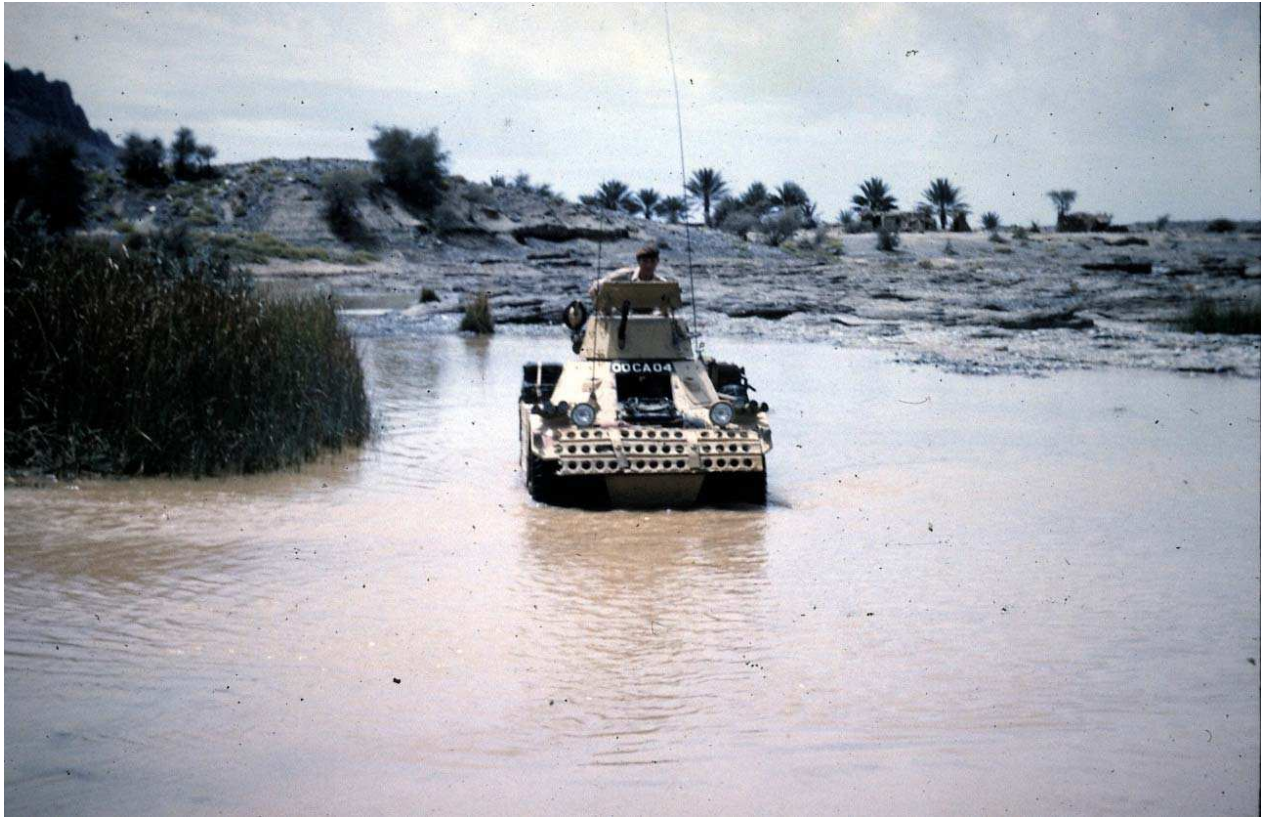
Description: Daimler Ferret Mark II scout car 00CA04 ford a river in Kuwait.