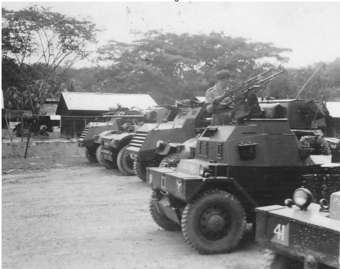
Description: Escort Troop at Kuala Pilah, Malaya. GMC Otter AC, Daimler AC & Dingo. Date Circa Aug – Nov 1954.