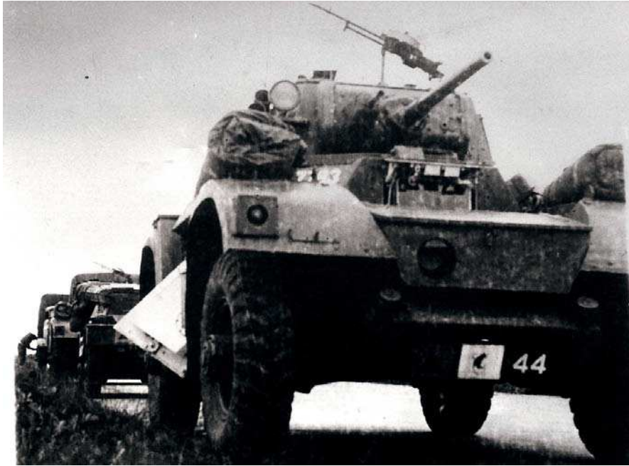
A Daimler Armoured Car of 11 Hussars, again the Vickers K gun is prominent upon its pintle mount on the top of the turret. Circa 1944