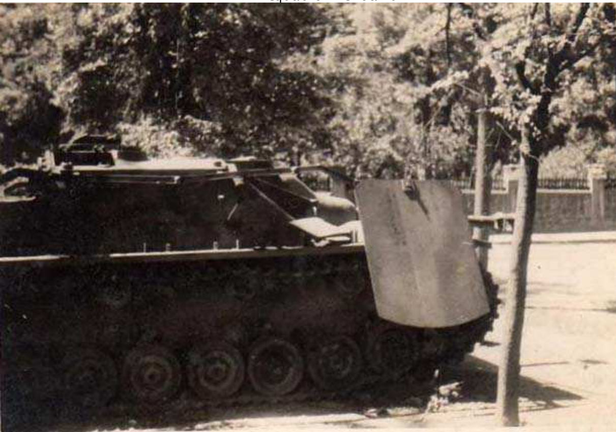
Description: Daimler armoured car 11 Hussars PAO, D Squadron Armed with a Little-John adaptor knocked out this Stug. Germany 1944.

Description: A Mark 2 version of the Daimler armoured car being used by the 11 Hussars PAO, D Squadron . Circa 1944.