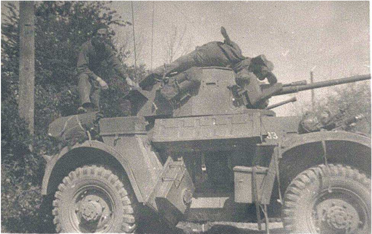
Description: A Daimler Scout Car F ???33, of 11 Hussars Circa 1944