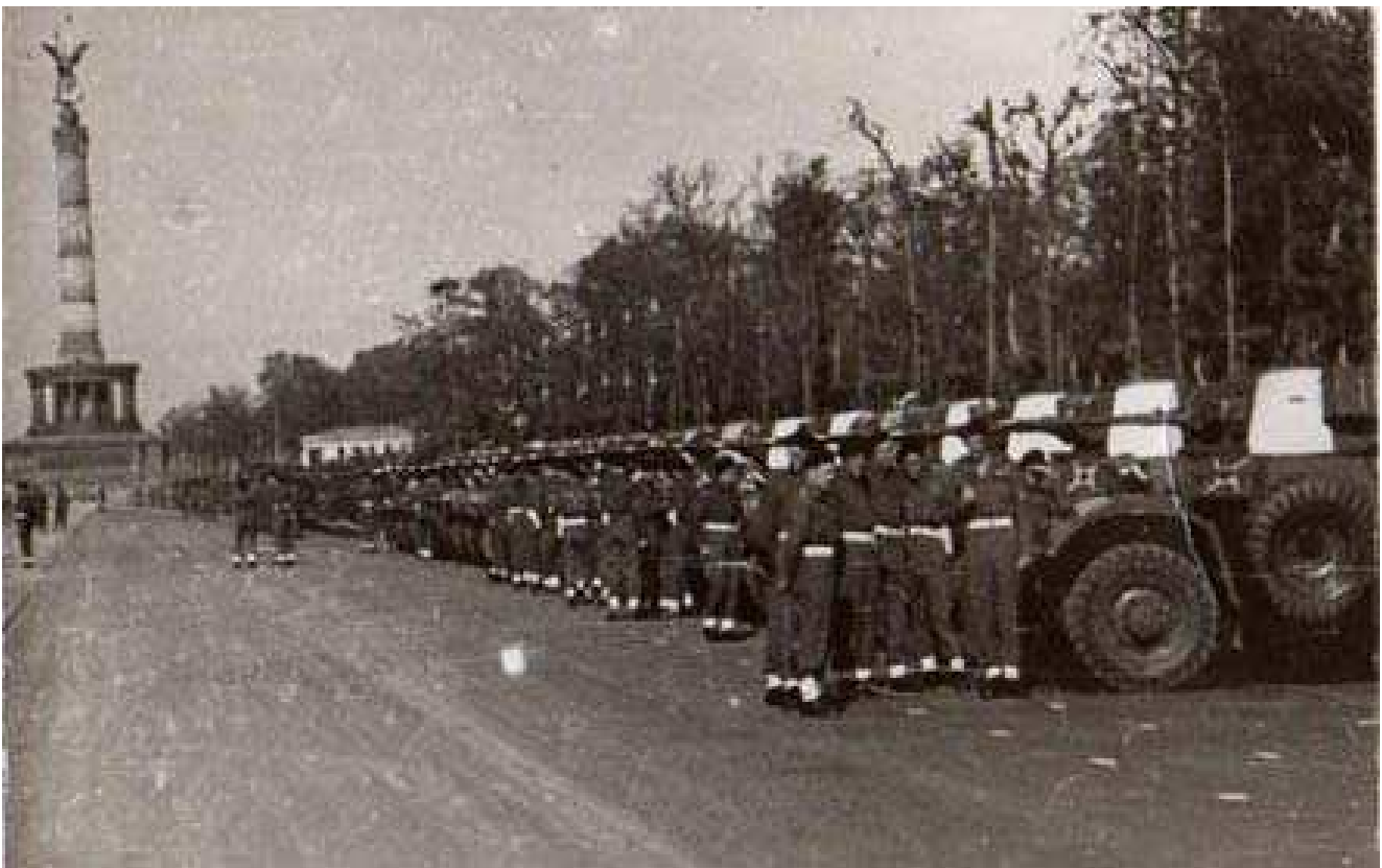
Description: Daimler armoured car 11 Hussars PAO, D Squadron, Victory Parade Berlin. Date: 13 th July 1945