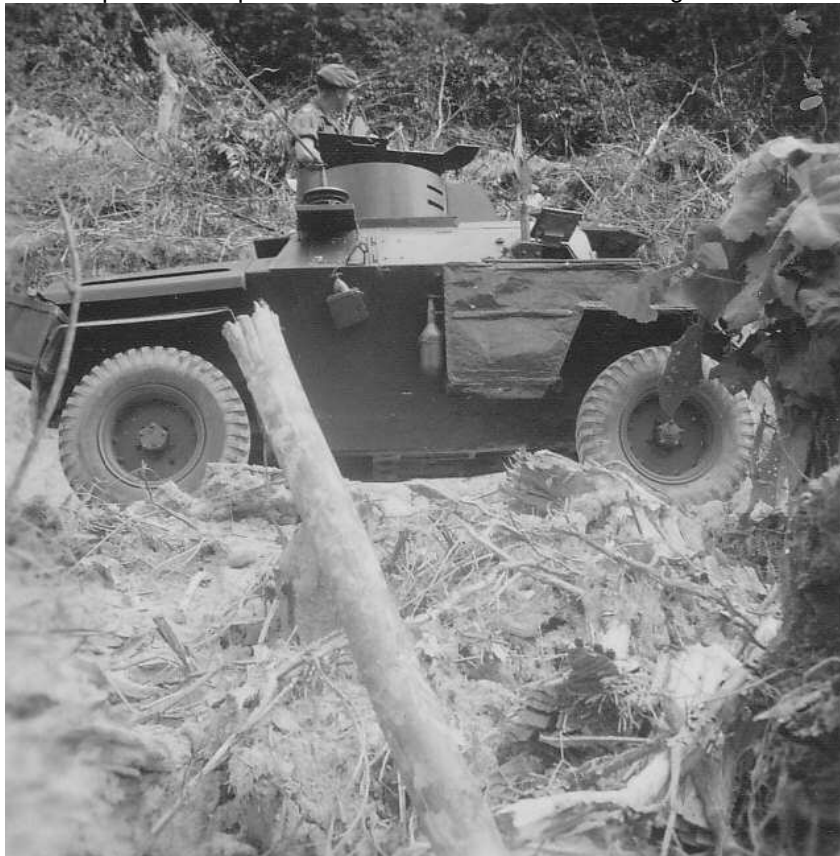
Description: Infantry Humberette with a locally adapted “bodged up” turret. Date Circa Aug – Nov 1954