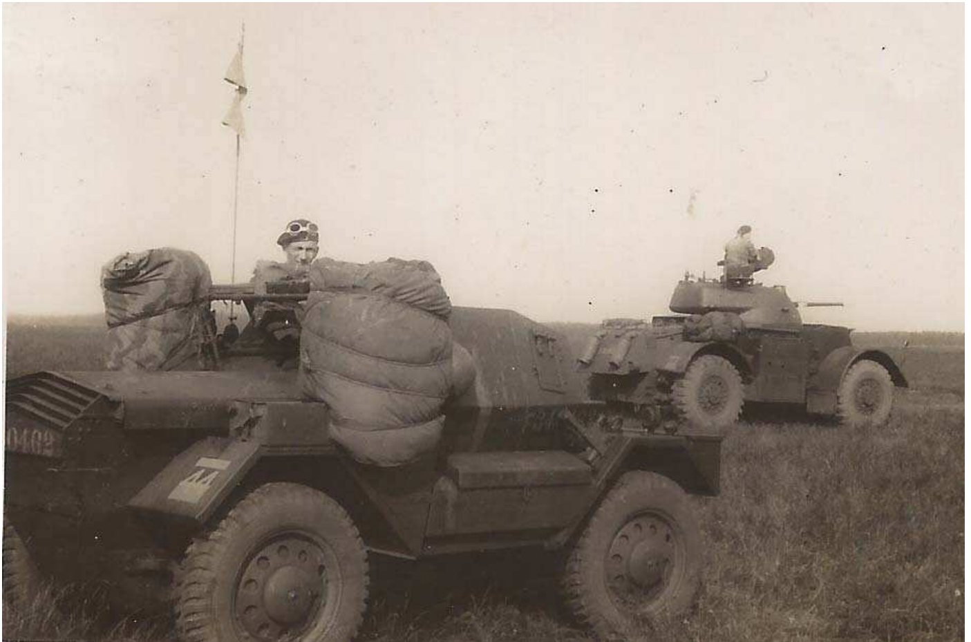
Description: Dingo F340762 Daimler Dingo & Staghound at Marienthal Austria Date: Circa 1945-1946