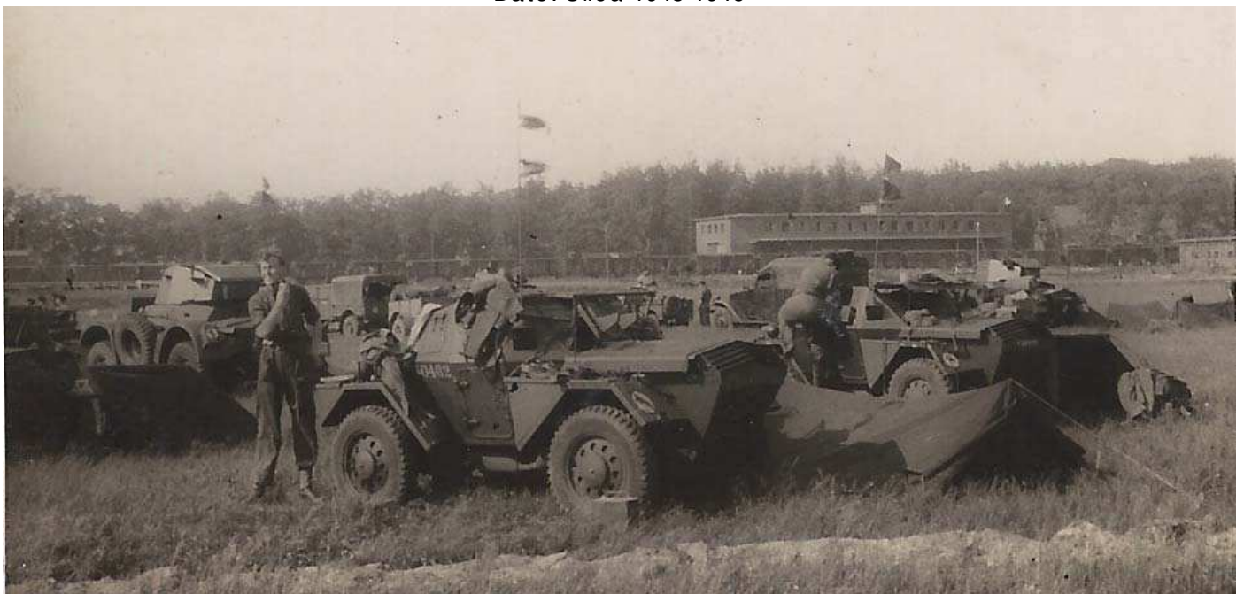
Description: Dingo F340782 at Marienthal Austria, overnight harbour Date: Circa 1945-1946