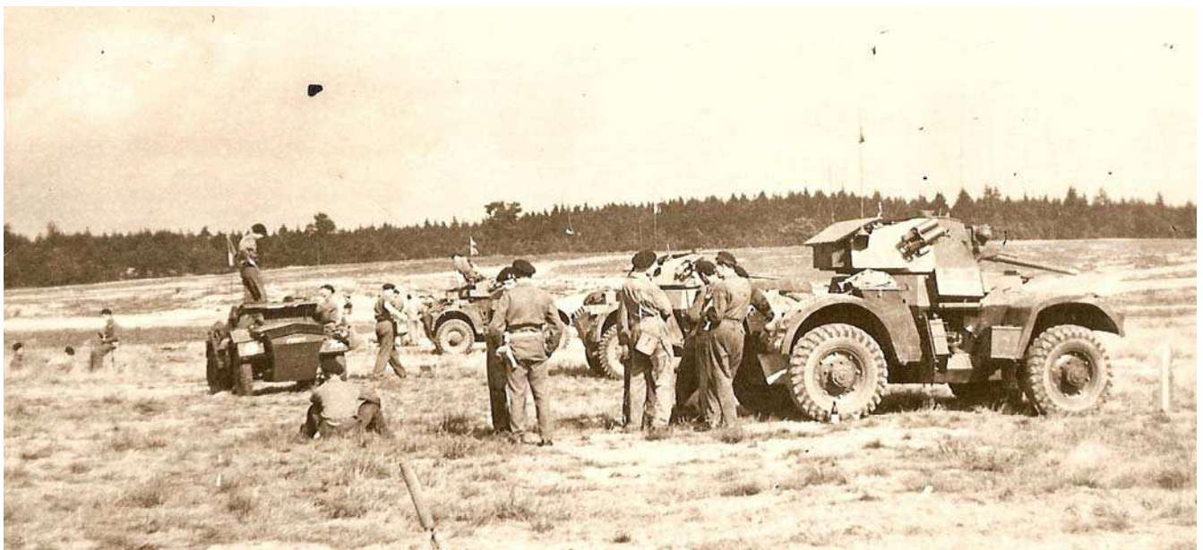
Location: Germany, Berlin. Description: A Daimler armoured cars line up on the firing ranges. Circa 1946