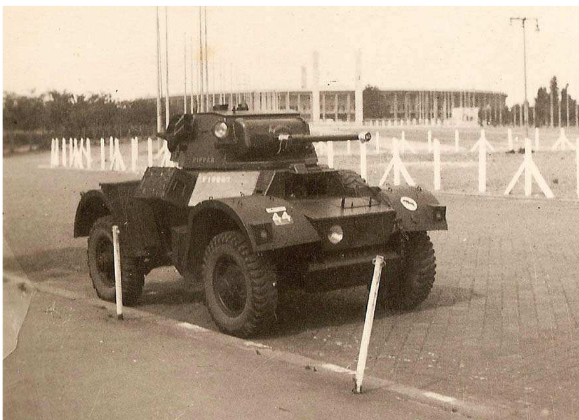
Location: Germany, Berlin, Olympic stadium Description: Daimler armoured car F19987 named DIPPER, part of the 30 Corp HQ Troop July 1946