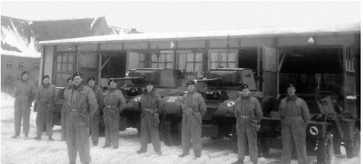
Location: Germany, Berlin.

Description, A Troop, Household Cavalry vehicles as part of XXX Corps. The Daimler armoured cars are ADVOCATE F??7794 and AFRICA STAR circa 1945-1946