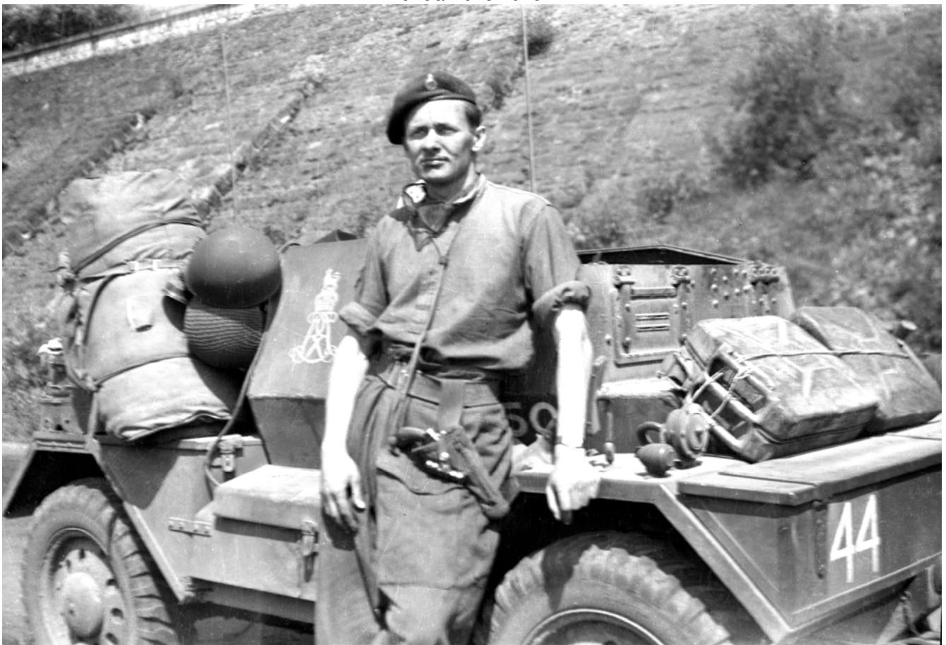
Description, Dingo post war back in the markings of the Life Guards circa 1945-1946

Description, A Troop, Household Cavalry vehicles as part of XXX Corps. The Daimler armoured cars are ADVOCATE F??7794 and AFRICA STAR circa 1945-1946