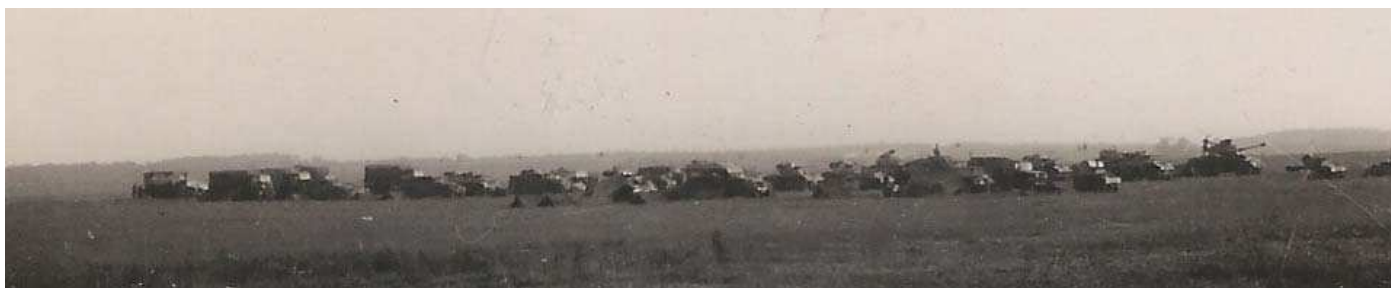
Description: The Sabre Squadron at Marienthal Austria, overnight harbour Date: Circa 1945-1946