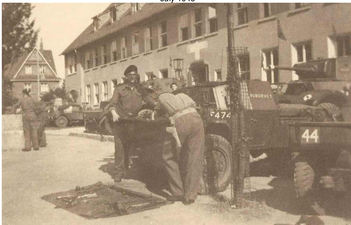
Location: Germany, Goslar. Description: The car crew of Daimler scout F474?? named DUBONNET, of 30 Corp prepare to carryout a tool check. DSC F47884 can be seen in the background. Circa 1947