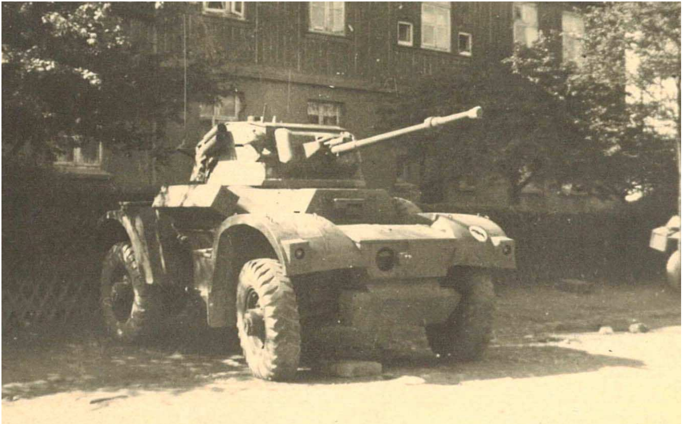
Location: Germany, Goslar.

Description: A Daimler armoured Car of XXX Corps, fitted with the with Littlejohn gun adaptor. Circa 1948