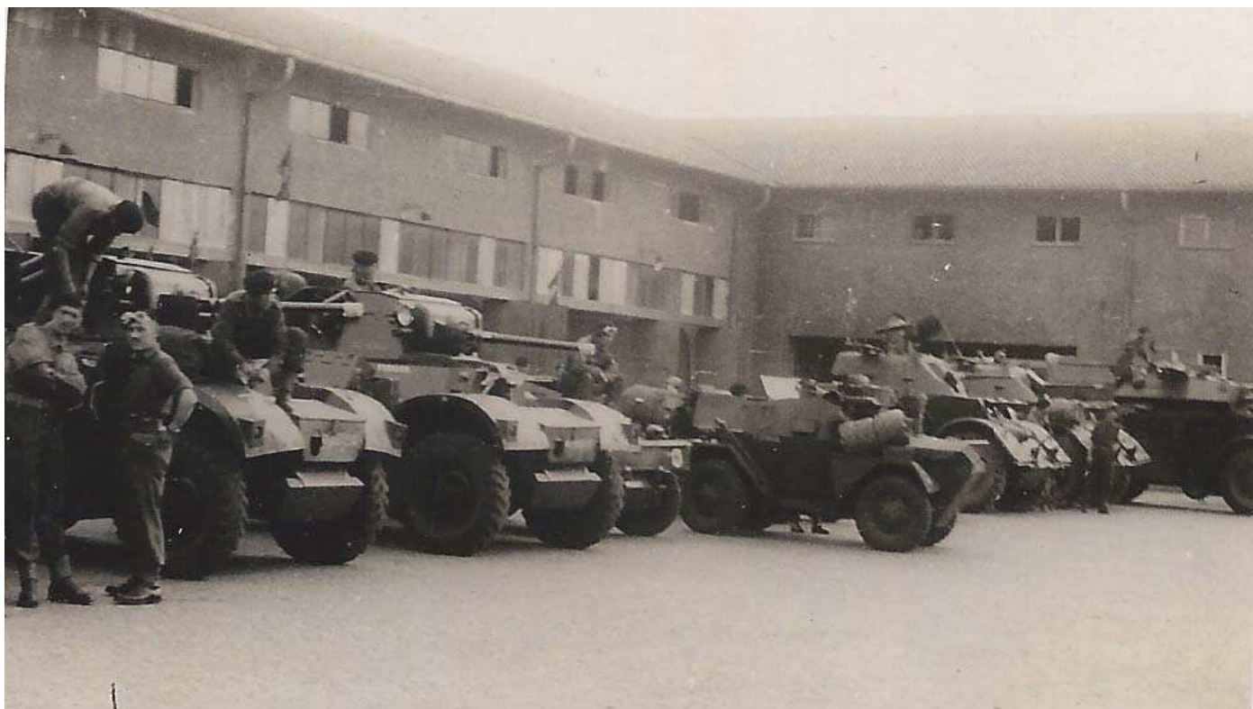
Description: Car Park Berlin. Date: Circa 1945-1946