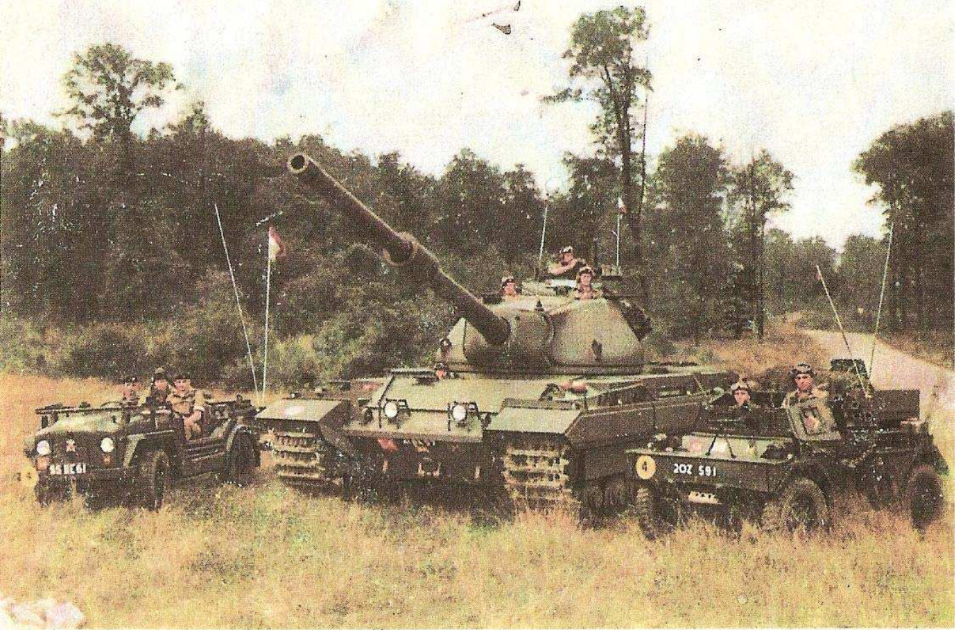
3 RD CARABINIERS (PRINCE OF WALES'S DRAGOON GUARDS) 1958