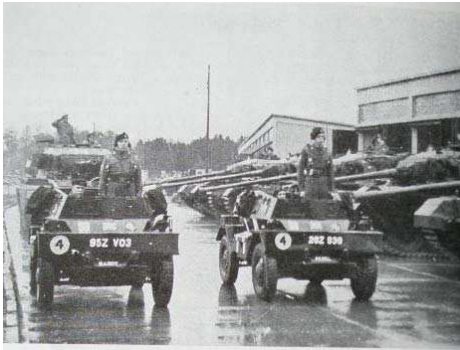
3DG dingos (95ZV03)(20ZS38) on Inspection Parade 1958 at OsnaBruck Imphal Barracks Germany, note the use of black webbing (similar to the RTR)