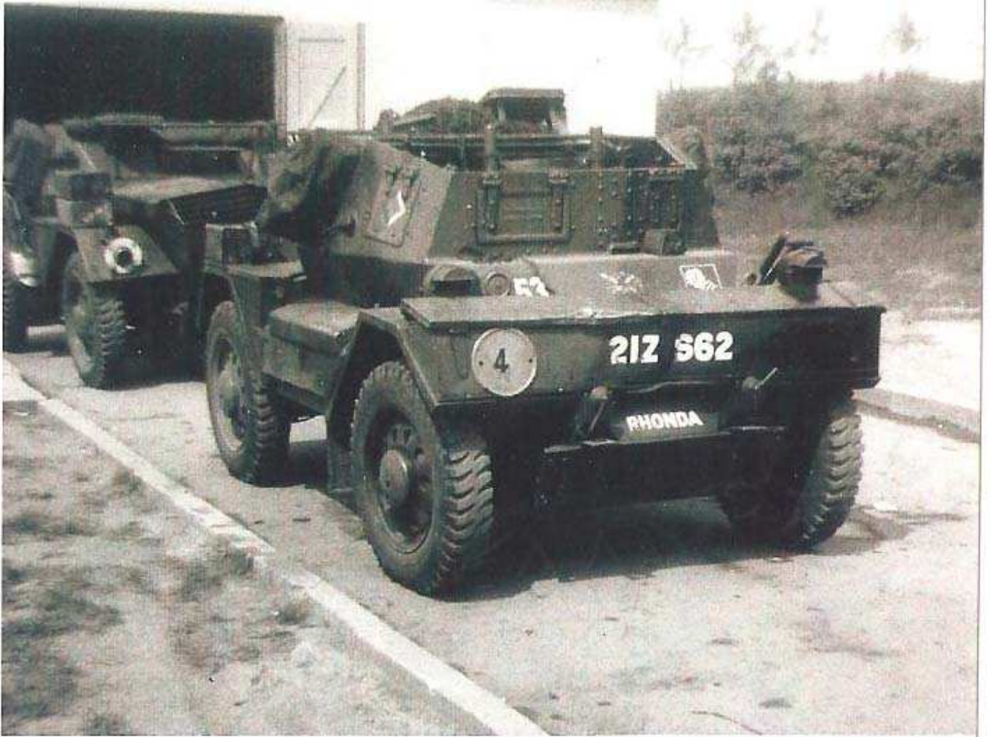
Description: Daimler scout car F329472 - 21 ZS62 of recce troop, Osna Bruk Barracks, Circa 1956