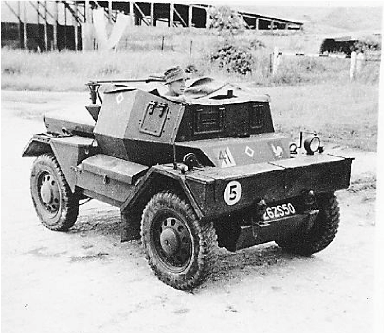
Description :Dingo 340631 26 ZS 50 on Malaya

To combat this Dingo's were fitted with closed steel covers incorporating a gun turret that could be rotated through 360 degrees. Bren LMG provided armament although others were also utilized.