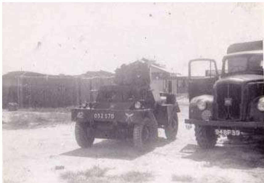
Description: Daimler scout cars 03Z570 and 12Z508 in Malaya. Date: not known.