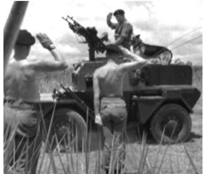
Image courtesy of Nigel Watson / Jimmy Monte (late) Photographer - Jimmy Monte Malaya

Description: The above photographs were taken of car F47427, 26 ZS97 in Malaya. The Alsatian dog had a kennel on the back of the dingo! And they used the him to flush out the CT's (he was very good at it seemingly).