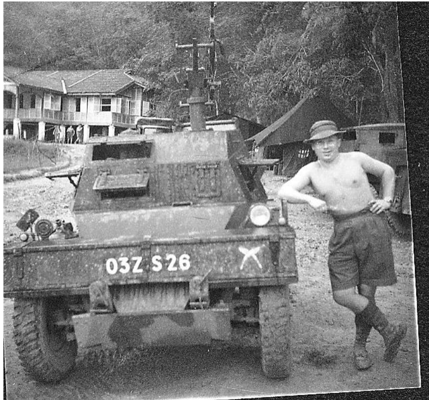
Description: Daimler scout car F206059 03ZS26 Malaya. Date: not known.