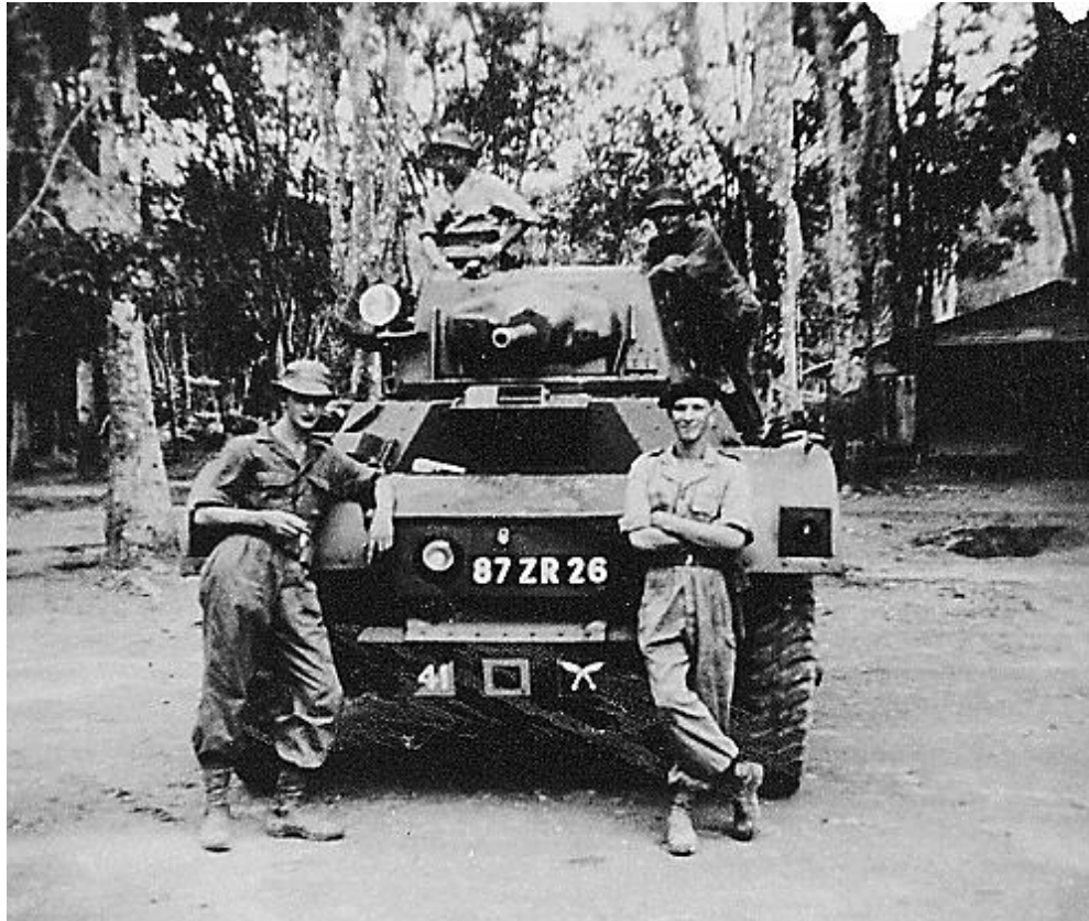
Description: Daimler Armoured Car F208445 / 87ZR26