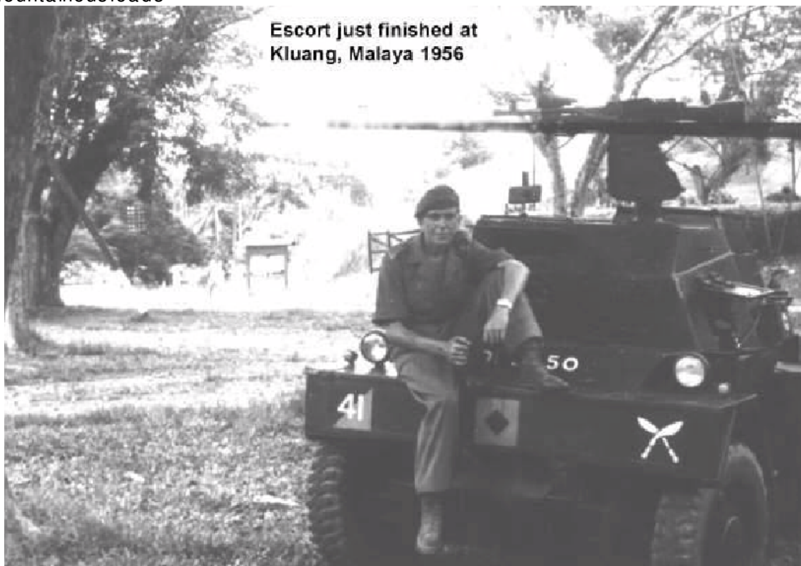
Description: Escort just finished at Kluang Malaya 1956

Equipment was found to be in short supply or unsuitable for the role to which it was now to be used. The open top scout cars in particular were found to be very vulnerable when hemmed in by dense jungle on narrow mountainous roads