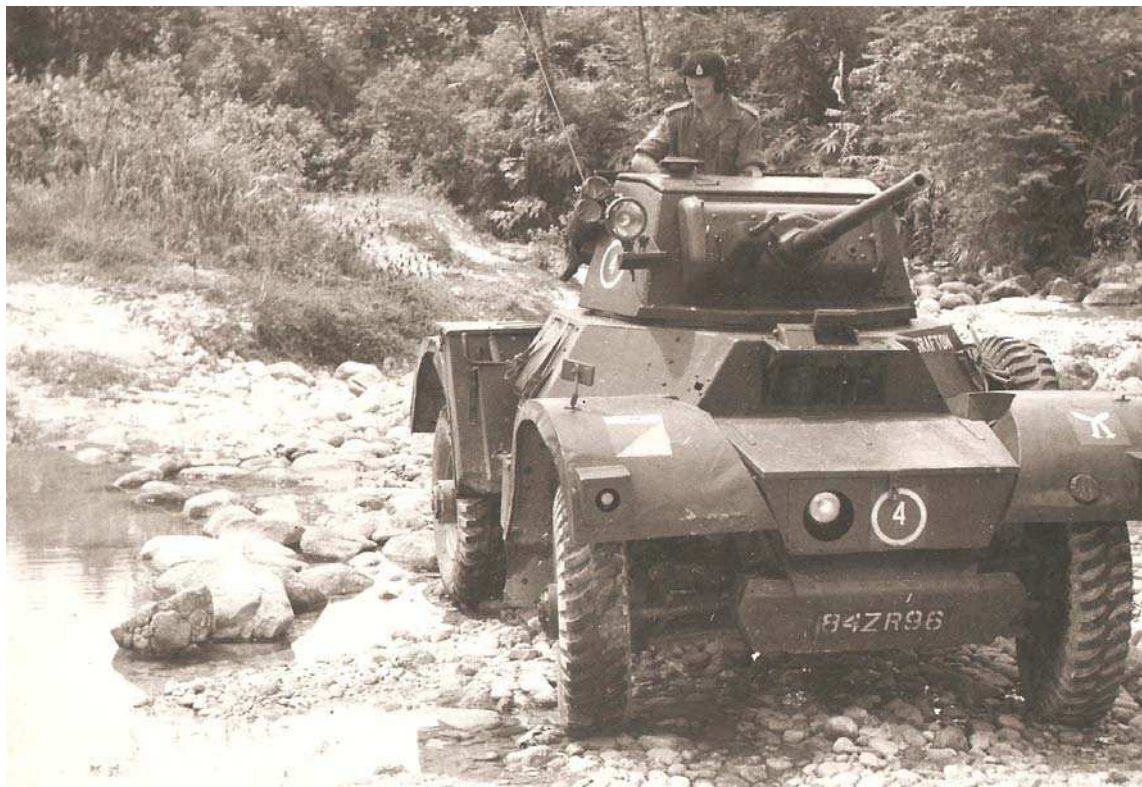
Description: Daimler scout car F207555 84ZR96 Malaya. Date: not known.