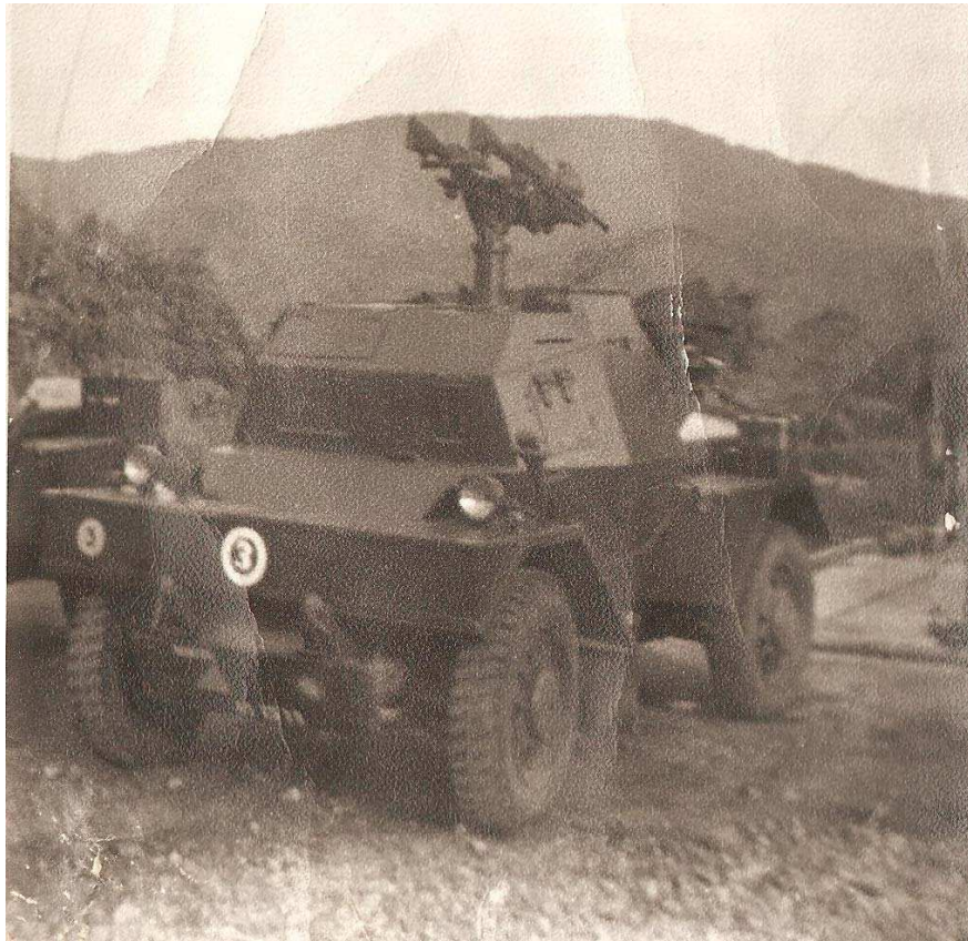
Description: Dingo Scout car.