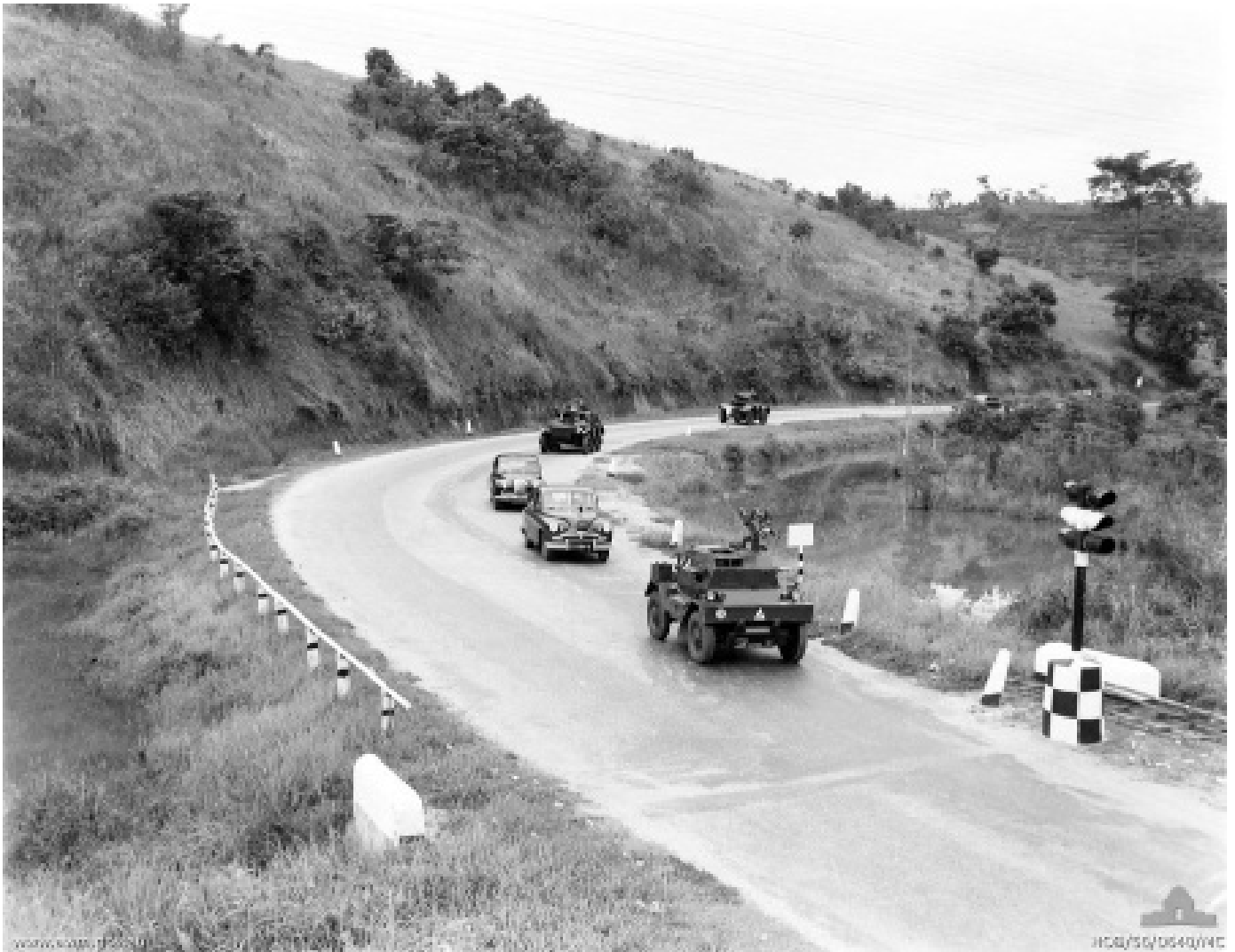
Malaya: Perak July 1956