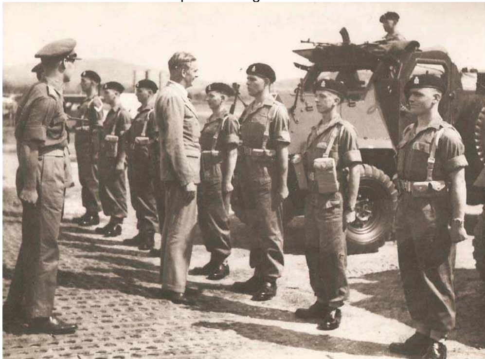
Description: Dingo Scout car (reputedly 00ZS00) and inspection by Anthony Eden Date: 1949