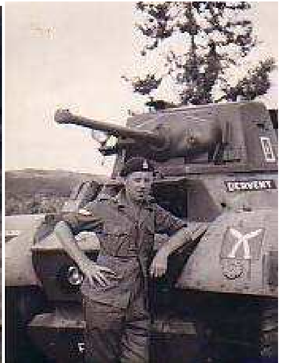
Description: The 11th_Hussars in with Daimler Mk 2 Armoured Cars